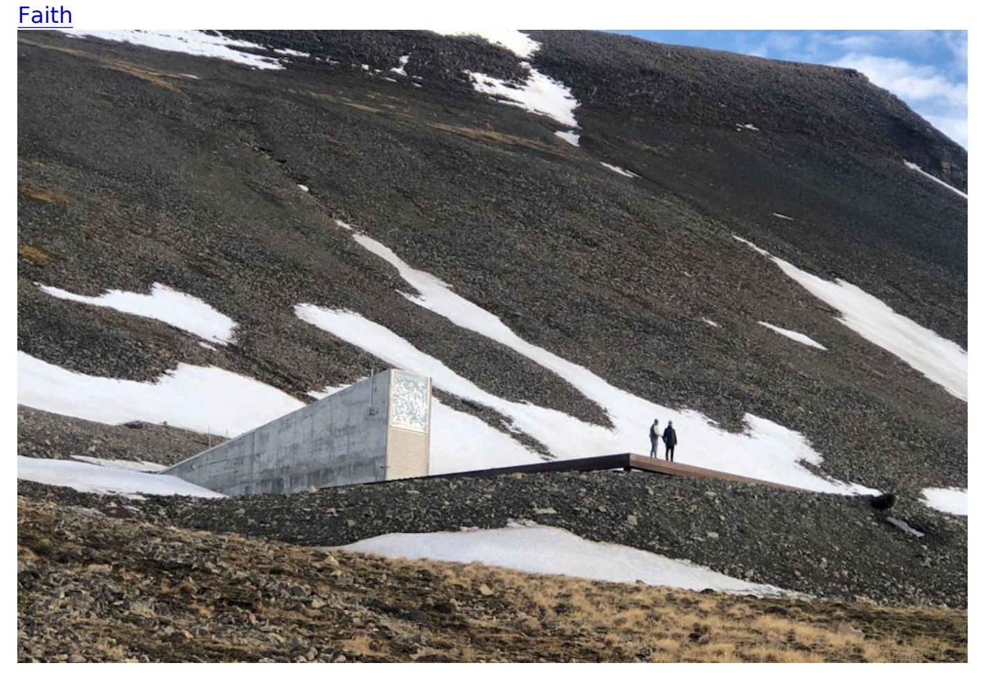
The Global Seed Vault in Svalbard, Norway.