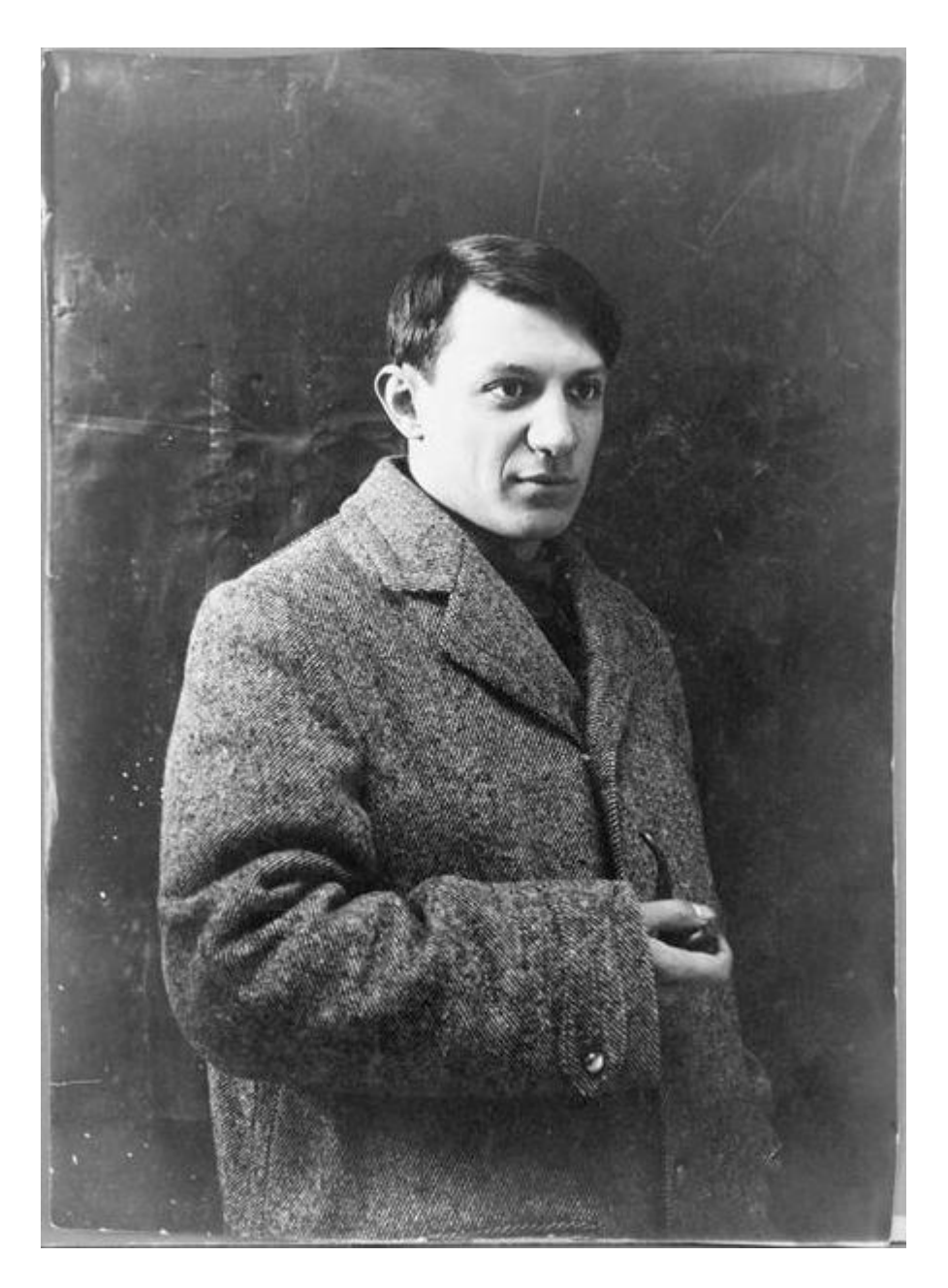
Portrait photograph of Pablo Picasso, 1908

But it is also noteworthy that Picasso observed otherwise-invisible women and decided, upon returning to his home studio, to beatify them visually, drawing upon a Spanish Catholic aesthetic vocabulary. This picture must have been important to Picasso, who included it in a 1932 exhibit — essentially his first major retrospective.