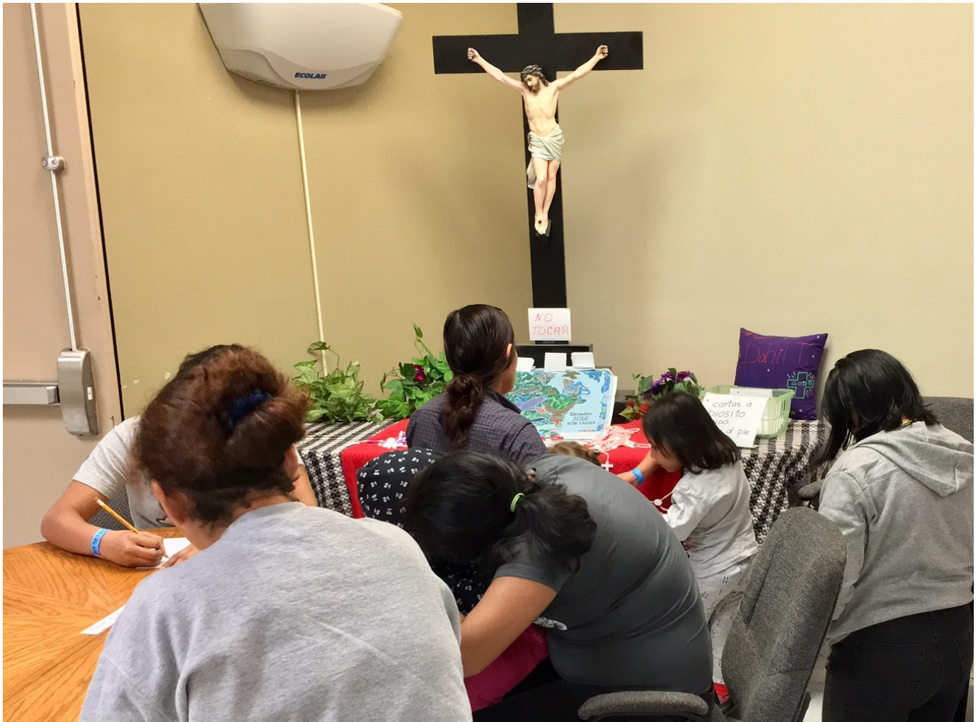
A group of immigrants pray at the Casa del Refugiado immigrant shelter in El Paso, Texas.

"It was deeply spiritual and evangelical work," he finally says, "but I have to say that I was the one being evangelized much of the time."