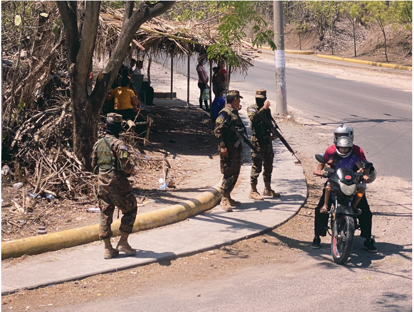
Armed Salvadoran soldiers arrive at an intersection to set up surveillance near El Paraiso in northern El Salvador April 23, 2022.