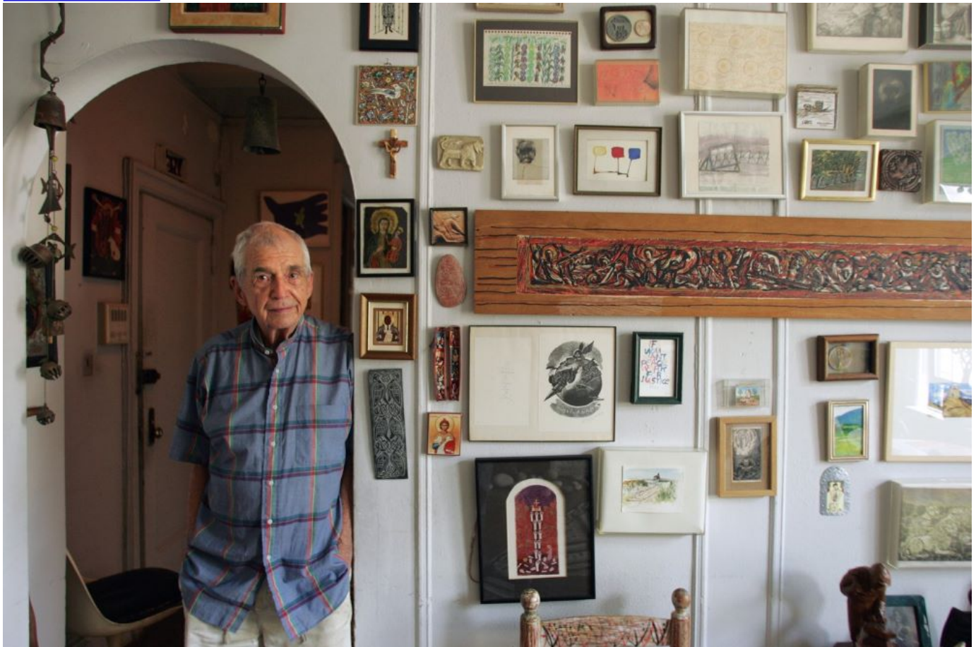
Jesuit Fr. Daniel Berrigan, then 85, poses in his New York City apartment in 2006. Berrigan died in 2016 at age 94.