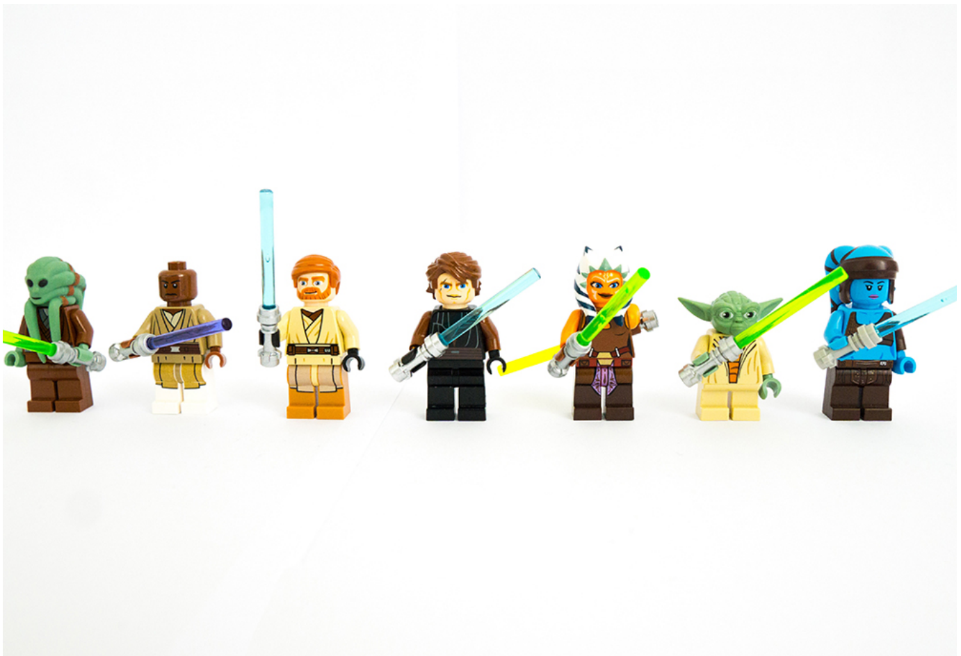
LEGO "Star Wars" minifigures are pictured, including (from left) Kit Fisto; Mace Windu; Obi-Wan Kenobi; Anakin Skywalker; Ahsoka Tano; Yoda; and Aayla Secura.

Our own participation in the Easter story. But we don't participate alone.