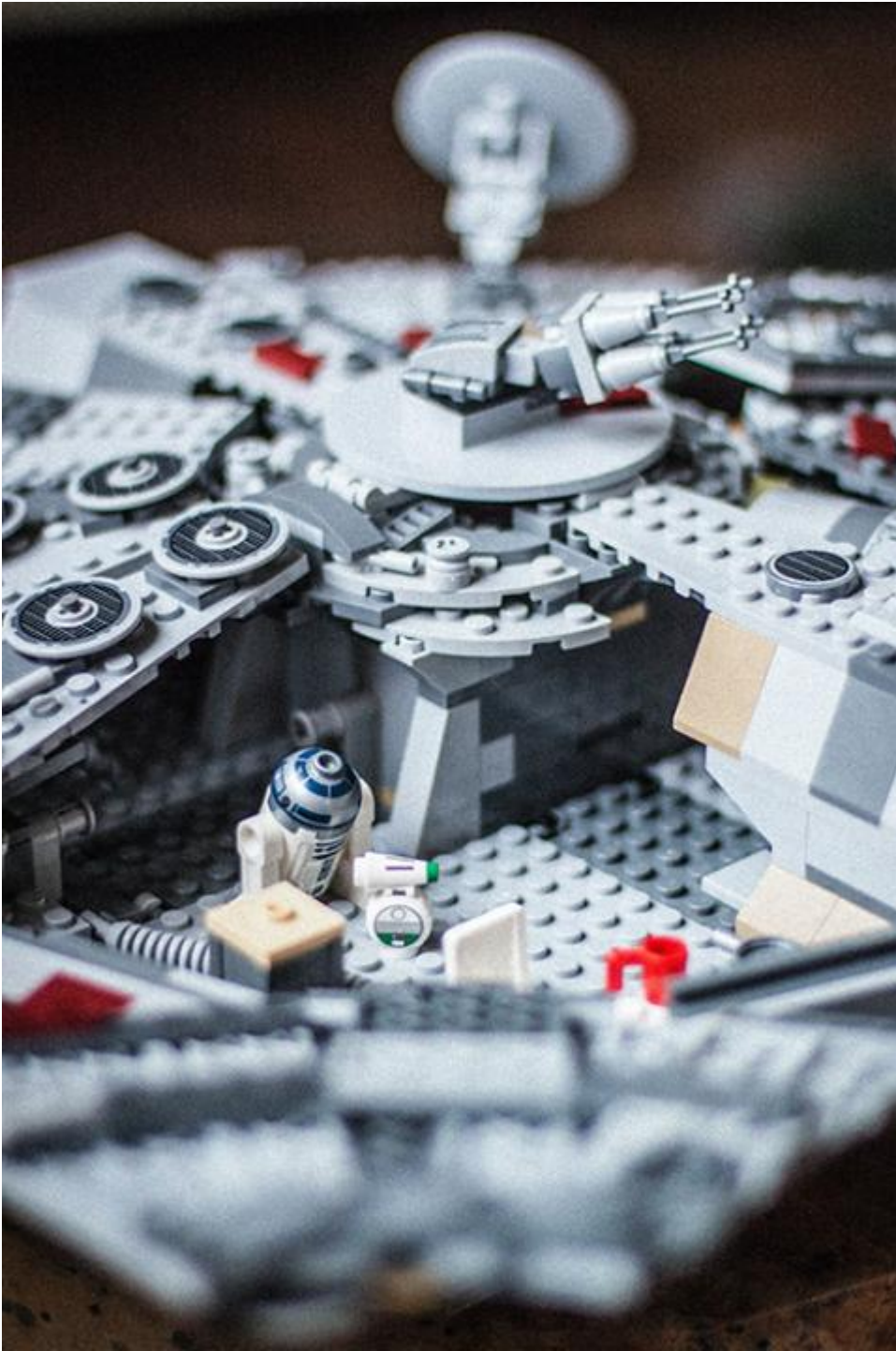
Lego "Star Wars" minifigures of droids R2-D2 and D-0 inside a Lego model of the Millennium Falcon ship.

It's the job of a parent to help children envision what life should be like, how society should function. What should be deemed important and essential and valuable. How we should treat one another. To expand the young imagination beyond the