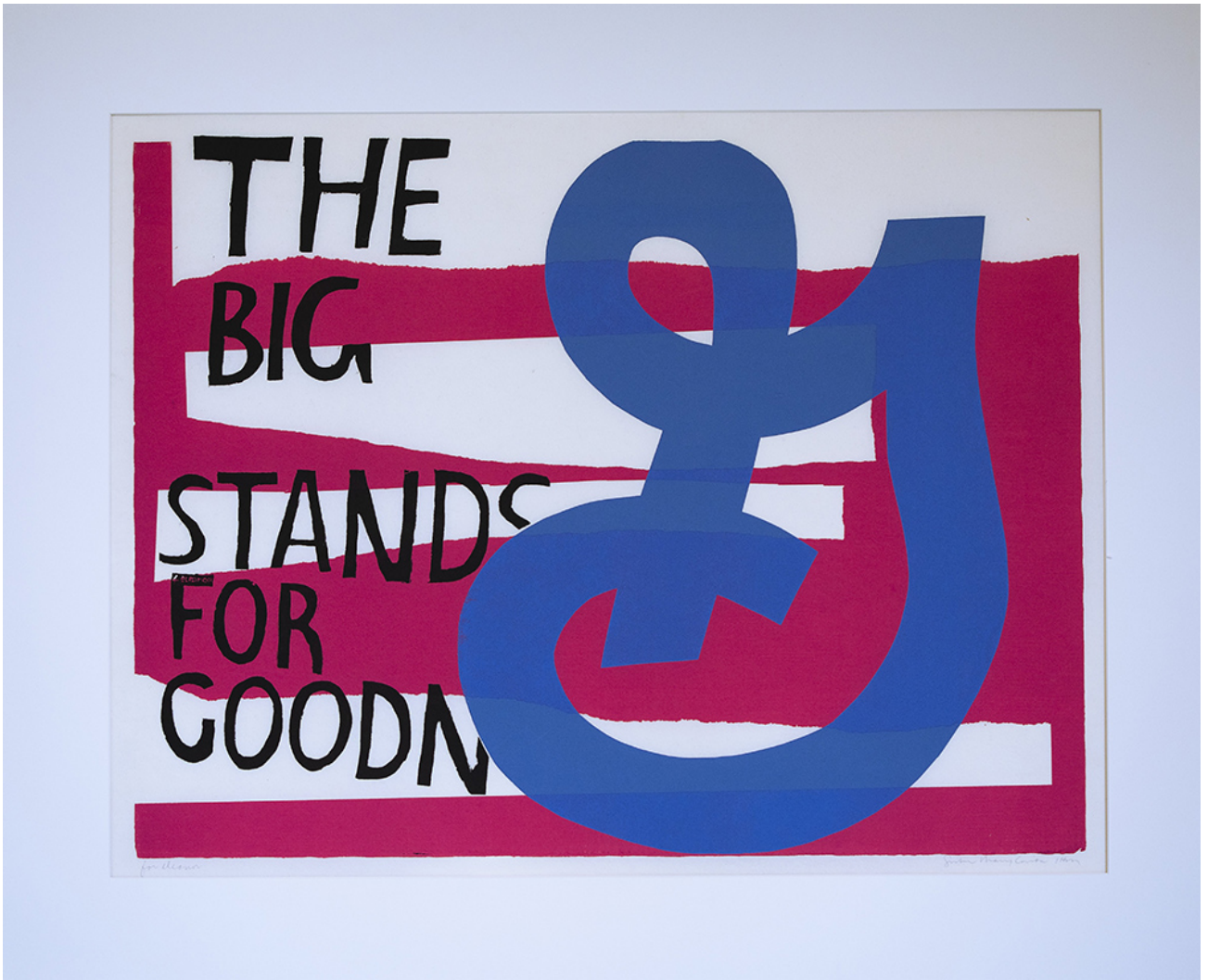
Sr. Corita Kent's 1964 work "For Eleanor," is seen Feb. 17 at the Theological College in Washington.