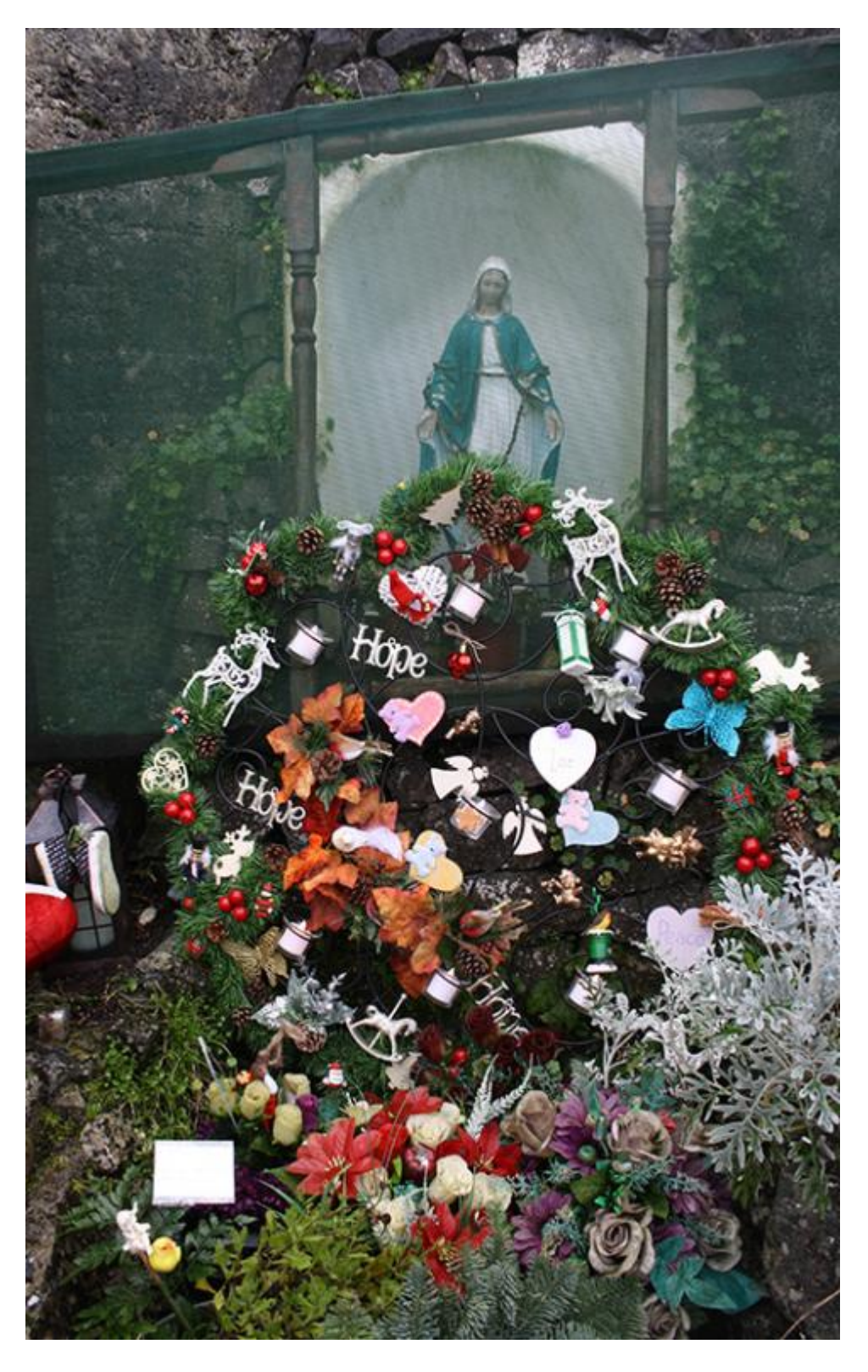
A wreath laid at the site of the former mother and baby home in Tuam, seen in a picture taken December 2021