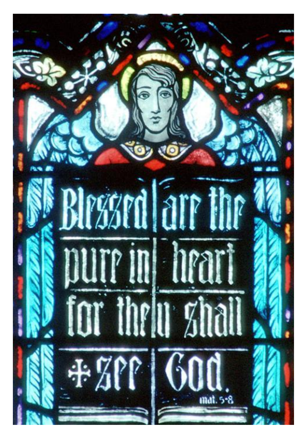
One of the Beatitudes is displayed in a church window.

The pure in heart are those who do the right things for the right reason. Anything other than that cannot be trusted. Worse, doing the right thing for the wrong reasons makes us rogue Christians at best. Too often we hold up as model citizens those who ignore the needs of others in order to magnify, to inflate, themselves. The Beatitudes tell us that we cannot allow the compass of the heart to fail us in favor of