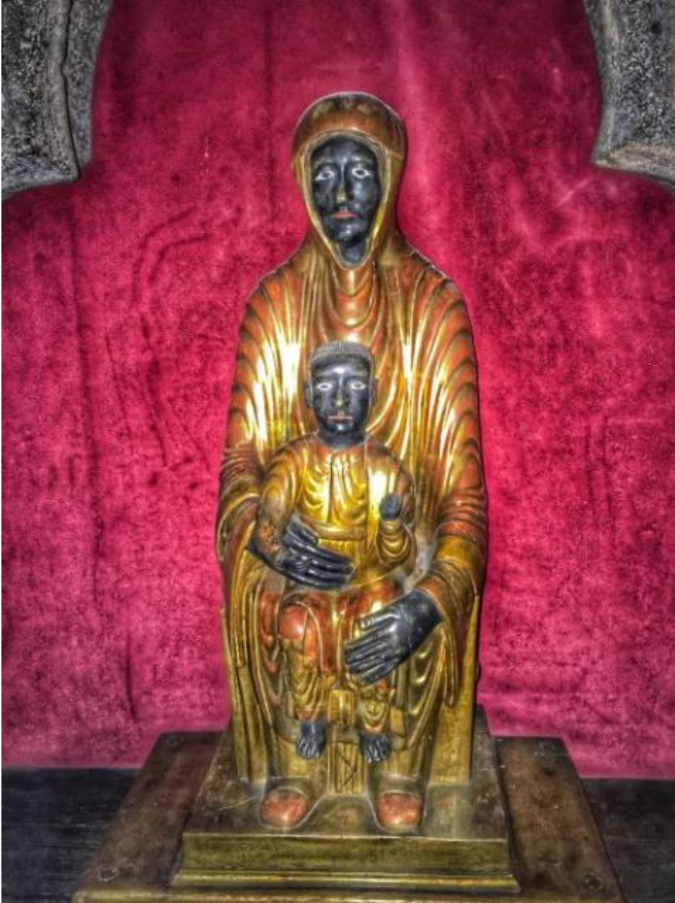
A detail from Our Lady of the Good Death at the Cathedral of Our Lady of the Assumption of Clermont-Ferrand, France

frame God not only as male but as specifically a white male? How does that perception of God shape our perception of one another? Of ourselves? Of our own value? How do those of us who are neither white nor male see ourselves as made in the image of God when surrounded by societal cues telling us that He is not of, with or for us? And how does the concept of a white male God impact those with privilege?