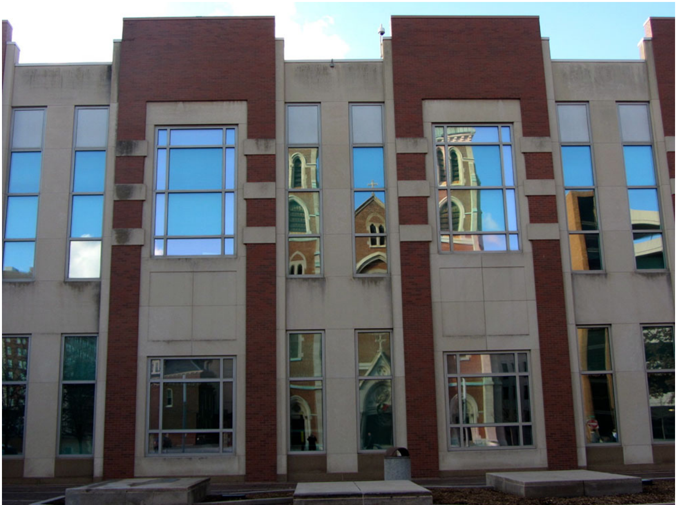
St. John the Evangelist Catholic Church is reflected on windows of the Indiana Convention Center in downtown Indianapolis.

Other significant expenses include $700,000 for marketing and promotional materials; $650,000 for entertainment; $150,000 to shuttle bishops, their staff and VIPs from their hotel to the venues; and $800,000 for security.