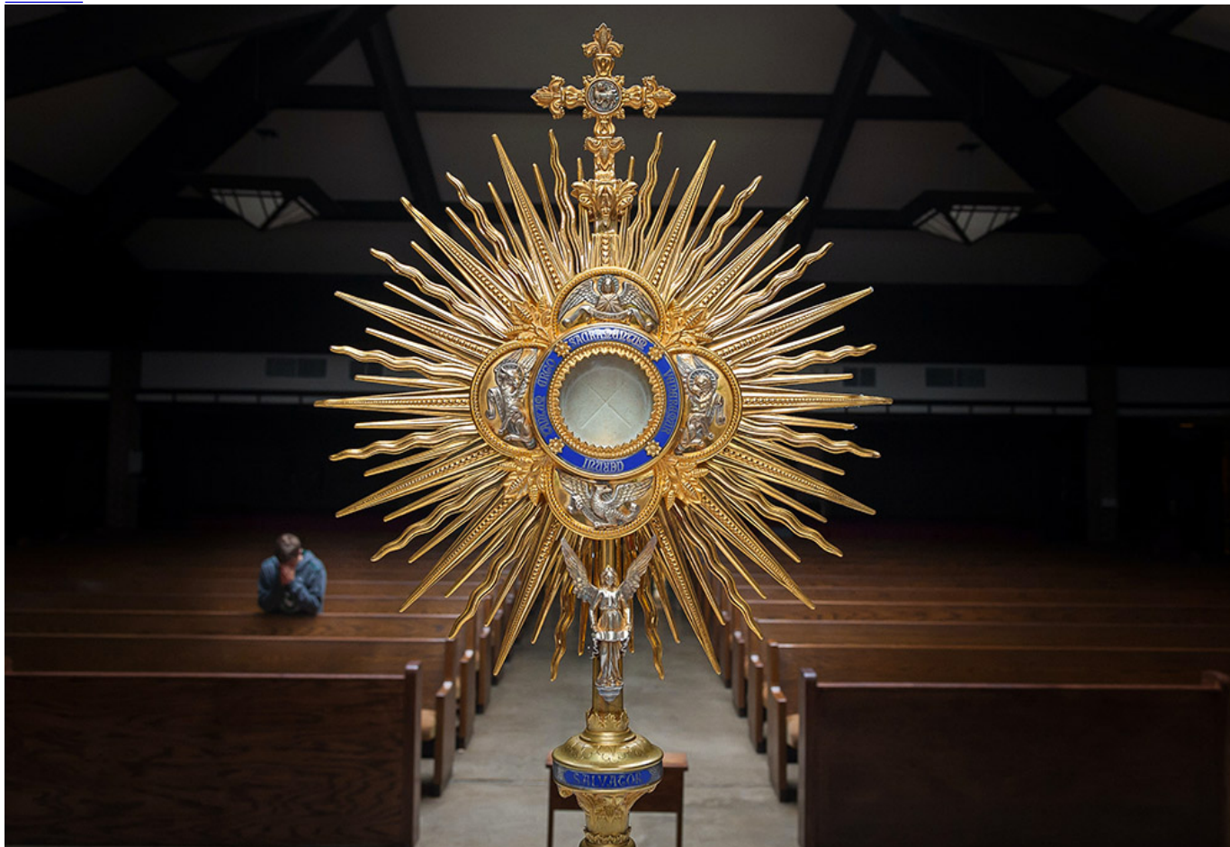
A monstrance holds the Eucharist at a church in Colorado.