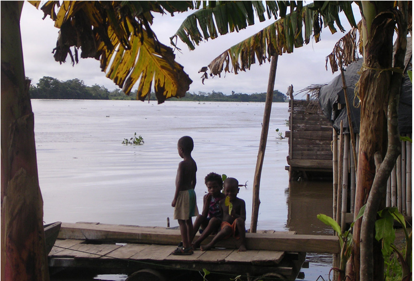
A child looks out on the Atrato River in the Chocó region of Colombia.

In their outreach to communities along the Atrato, the river guardians have focused on education and advocacy campaigns to raise awareness and understanding about the court ruling and its implications. They have developed a website, a local newspaper, infographics and a social campaign called "We Are All Guardians of the Atrato."