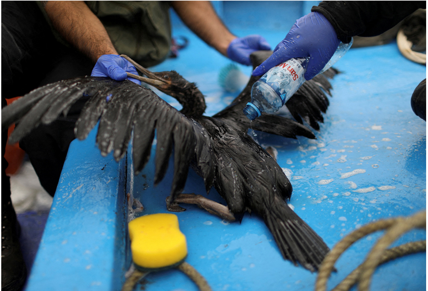
Biologists from the National Service of Protected Natural Areas work on a bird Jan. 21, in Ancon, Peru, affected by an oil spill near Lima.