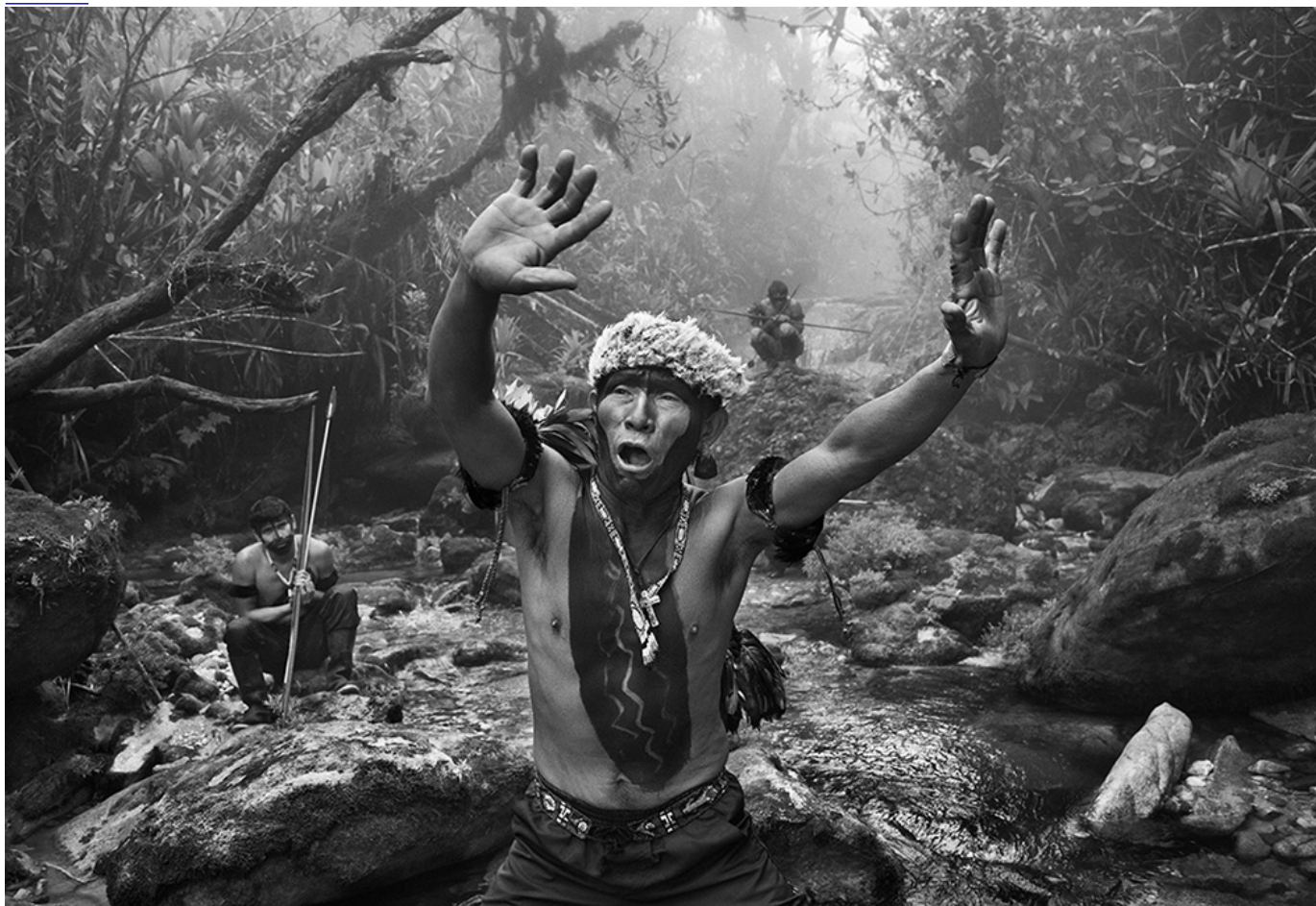
A Yanomami shaman converses with spirits before climbing Mount Pico da Neblina in 2014 in Amazonas state, Brazil.