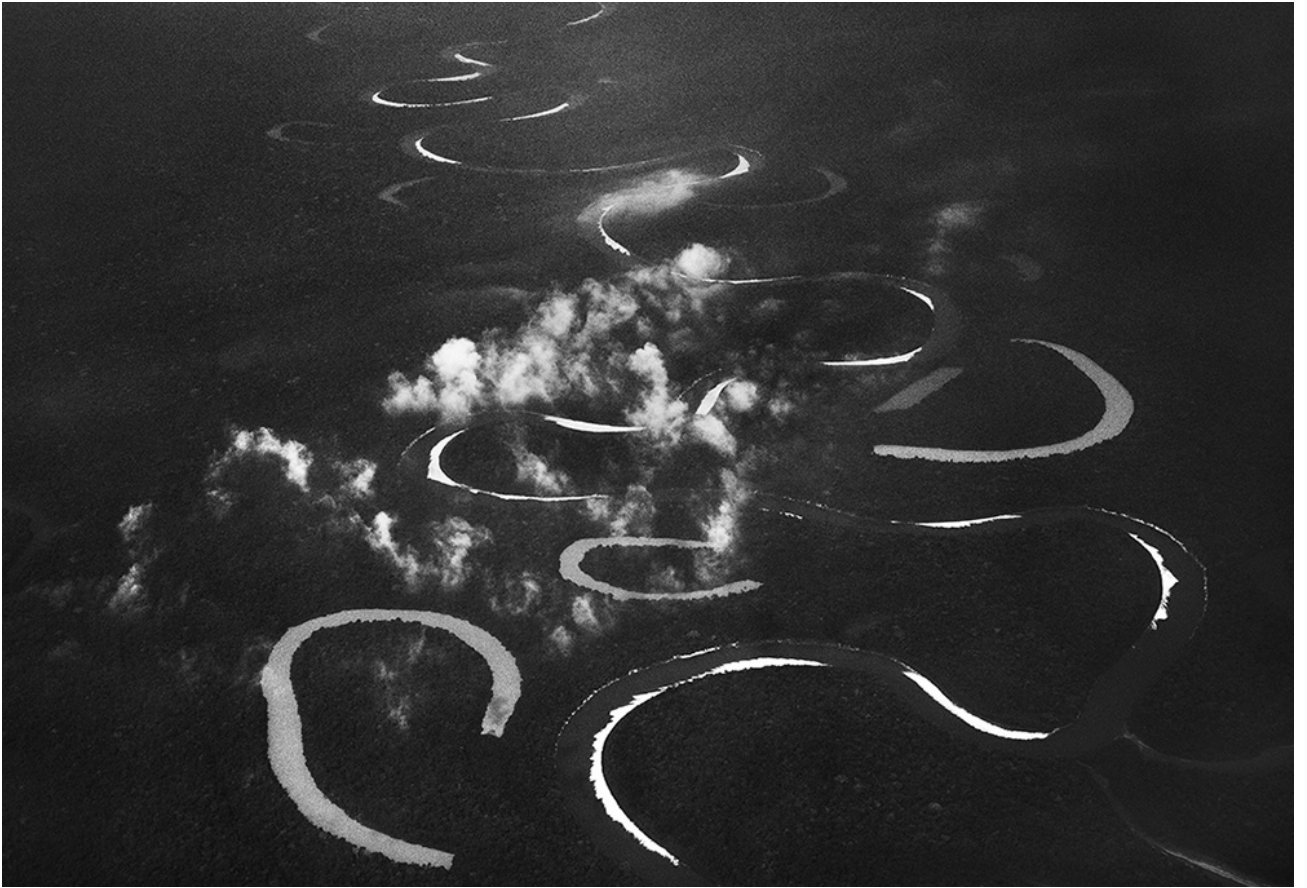
Rio Jutai in 2017 in Amazonas state, Brazil