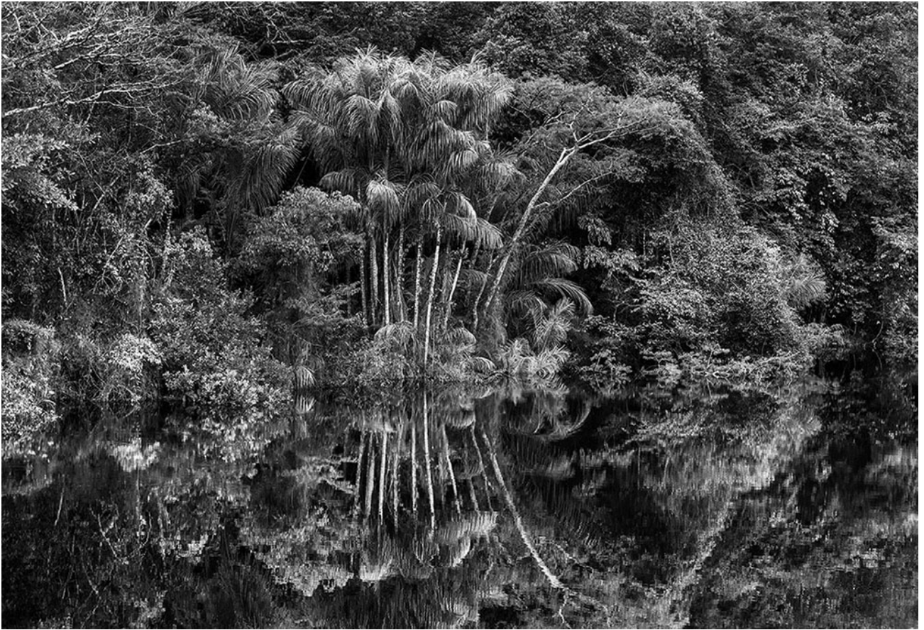
Rio Jaú in 2019 in Amazonas state, Brazil