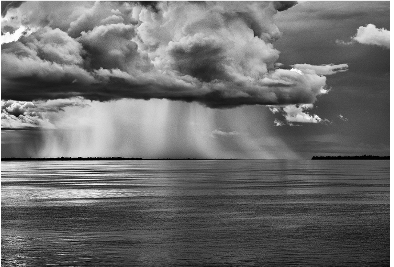
Rio Negro in 2019 in Amazonas state, Brazil