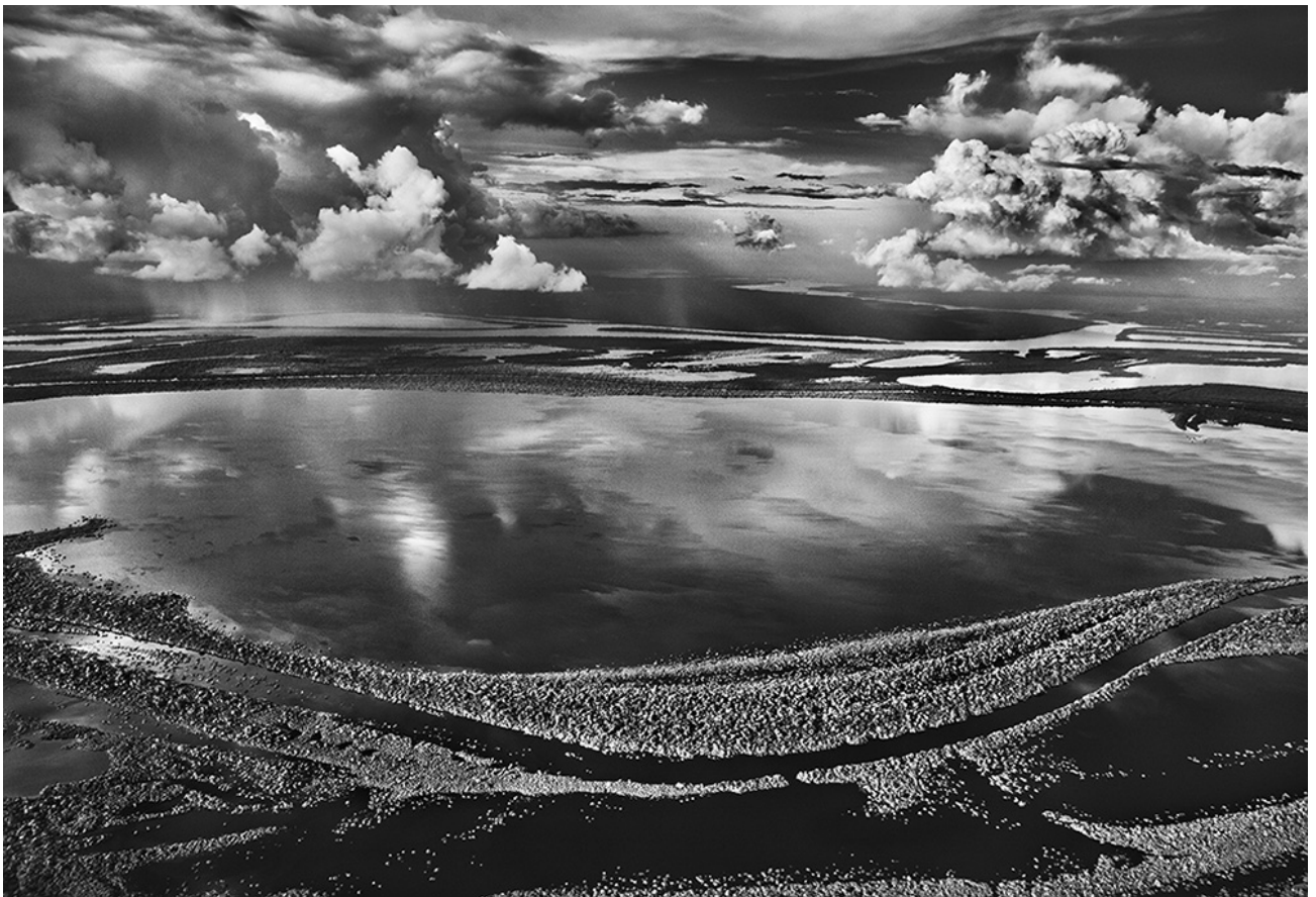
Anavilhanas, forest islands of the Rio Negro, in 2009 in Amazonas state, Brazil