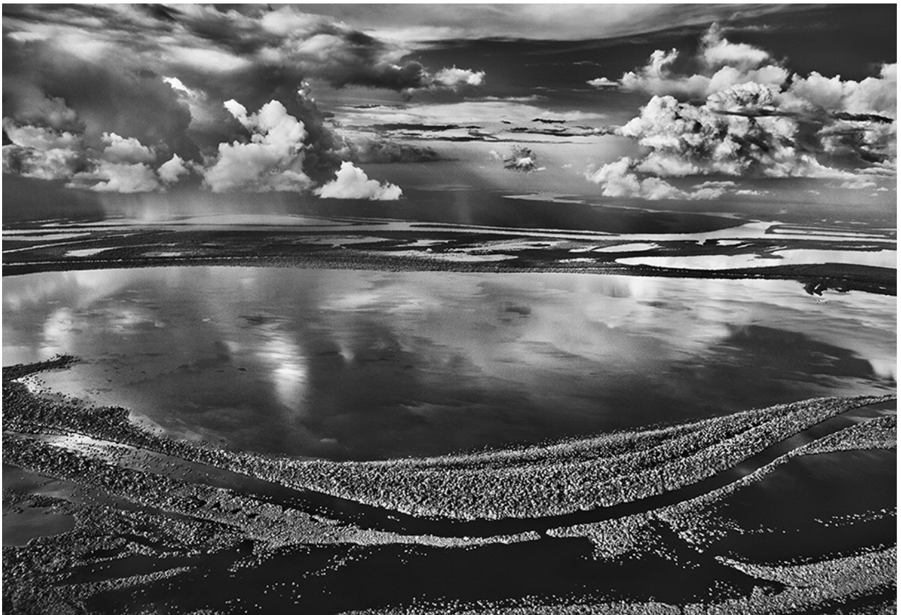
Anavilhanas, forest islands of the Rio Negro, in 2009 in Amazonas state, Brazil

Czerny, who served as special secretary during the Amazon synod and in December was named interim head of the Vatican Dicastery for Promoting Integral Human Development, told NCR that in a region full of color, displaying the photos in black and white is "another way of saying 'pay attention, pay attention' " to a region in need of it.