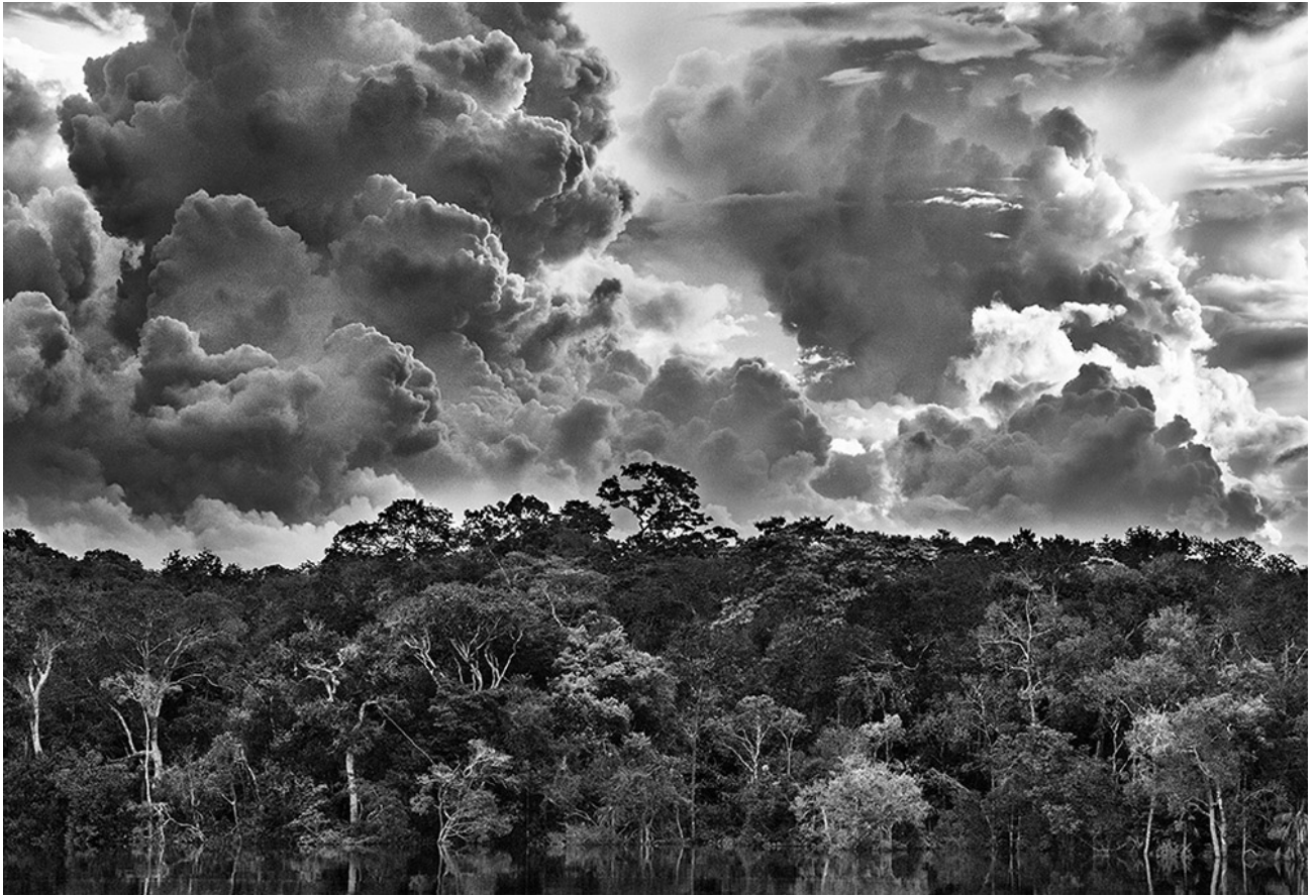
Fluvial archipelago of Mariuá, in 2019 in Amazonas state, Brazil

That call for attentiveness is one that Pope Francis has made since October 2017 when he announced a special synod on the Amazon, one meant to discuss both the pastoral needs of the remote region and to help awaken the world's attention to its destruction.