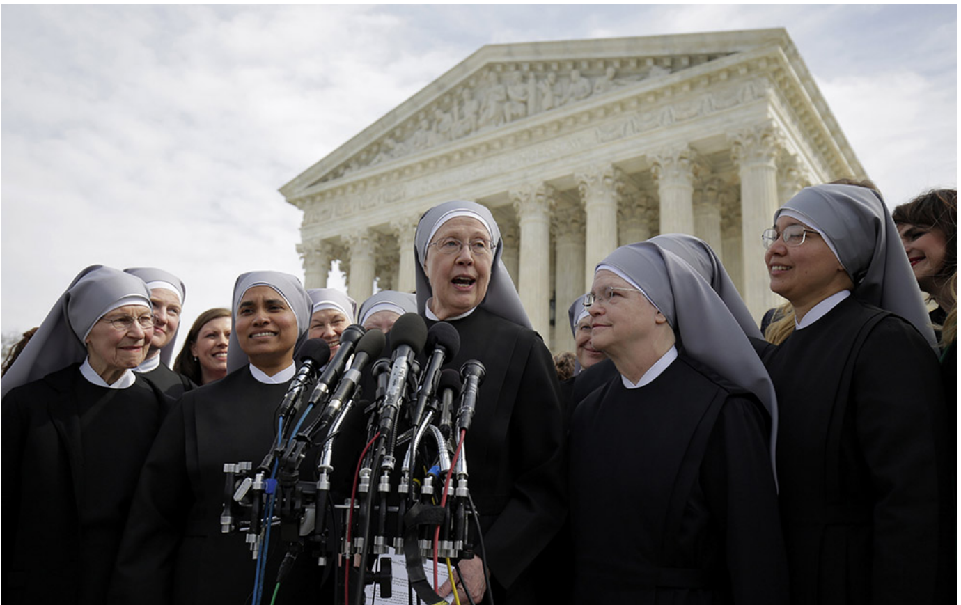
The Denver-based Little Sisters of the Poor speak to the media outside the U.S. Supreme Court in Washington, D.C., in 2016. The Becket Fund represented the sisters in their fight against the Affordable Care Act's contraceptive mandate.