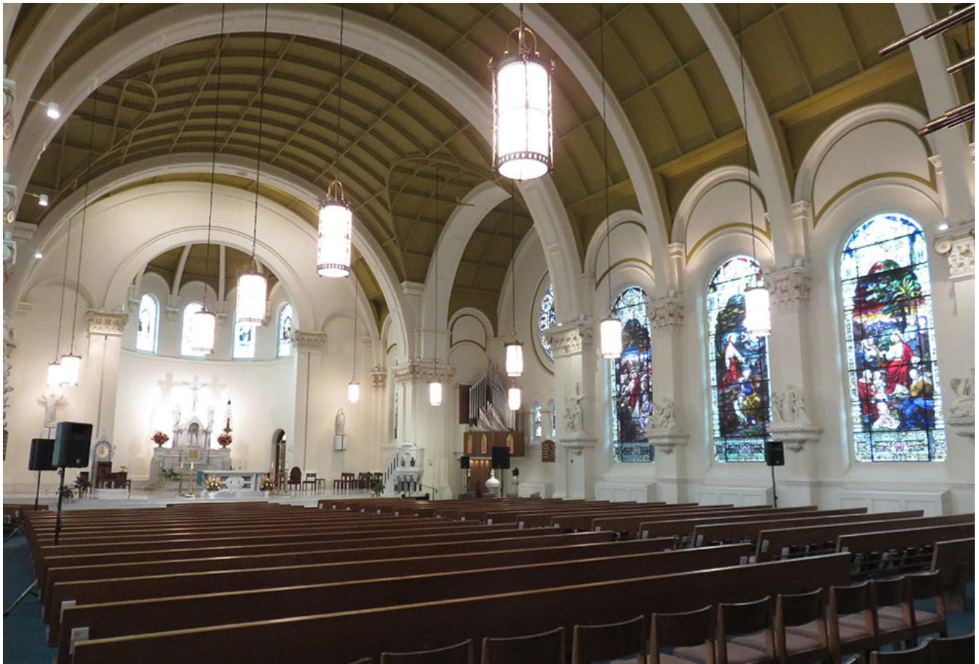
The interior of the Cathedral of Our Lady of Lourdes in Spokane, Washington

The Spokane diocese — led by Bishop Thomas Daly, an outspoken conservative prelate — received $10,000 for its annual Catholic appeal and $500 to support a local Catholic school. The Cathedral of Our Lady of Lourdes in Spokane was given $15,000 for general operations.