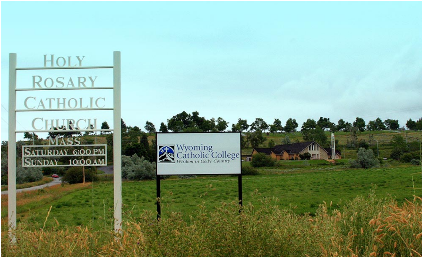
A view of Wyoming Catholic College's campus in Lander