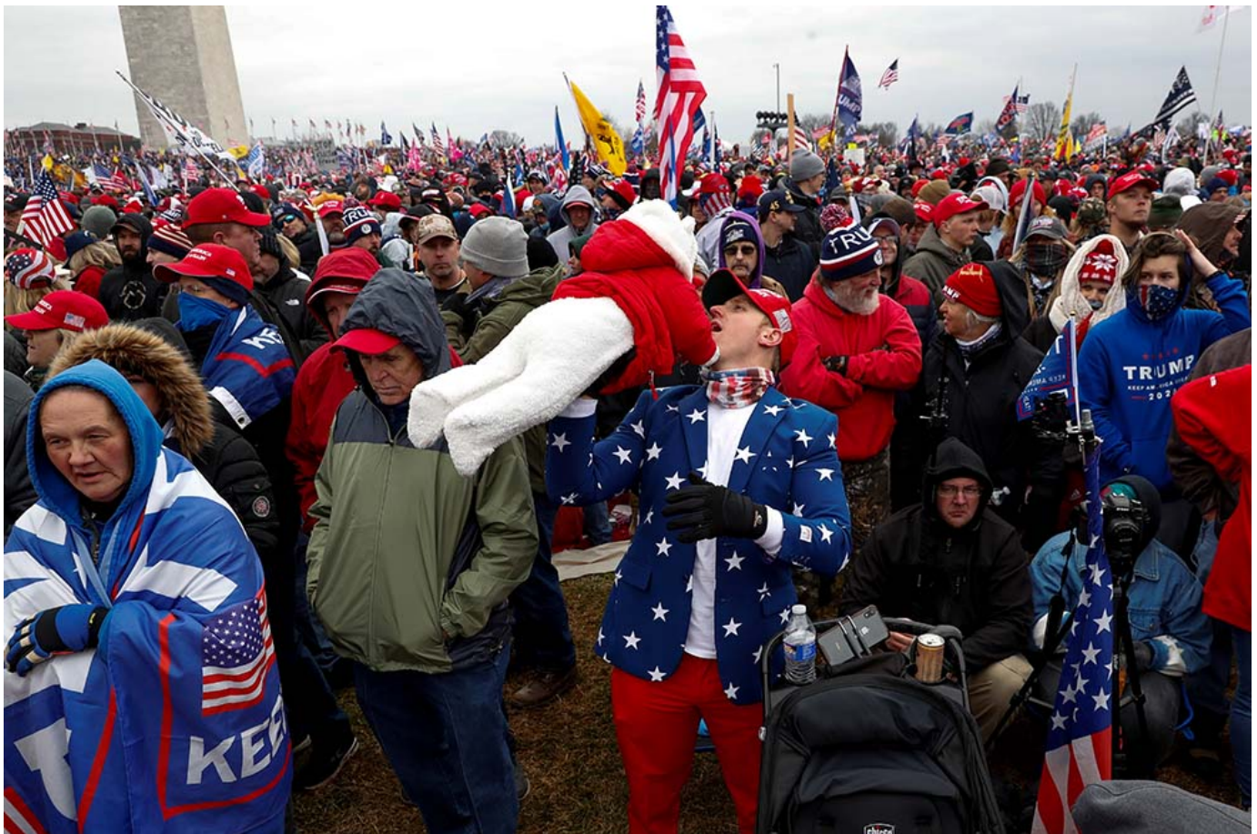
Supporters of President Donald Trump attend a rally in Washington Jan. 6, 2021, to contest the certification of the 2020 presidential election.

The Tea Party Patriots were one of the groups that helped organize the Jan. 6, 2021, rally preceding the attack on the U.S. Capitol. Turning Point USA helped transport busloads of Donald Trump supporters to the rally and participated in the "March to Save America" ahead of the event.