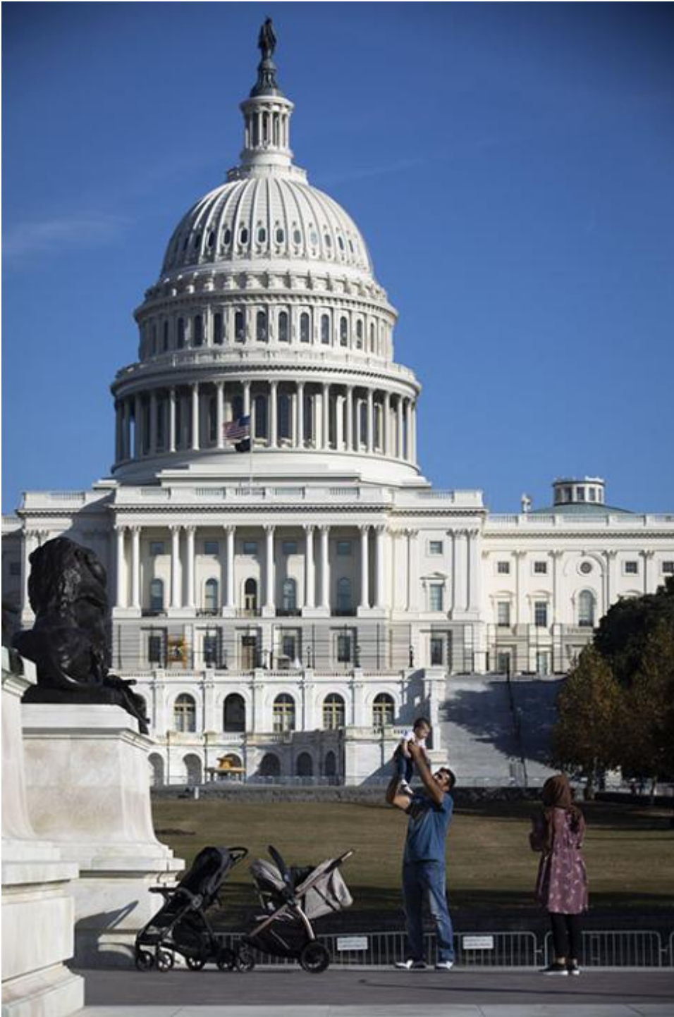
A family is seen near the U.S. Capitol in Washington Nov. 18, 2021.

Over time, I fear the backlash against overturning Roe will be large and consequential, but not necessarily in 2022.