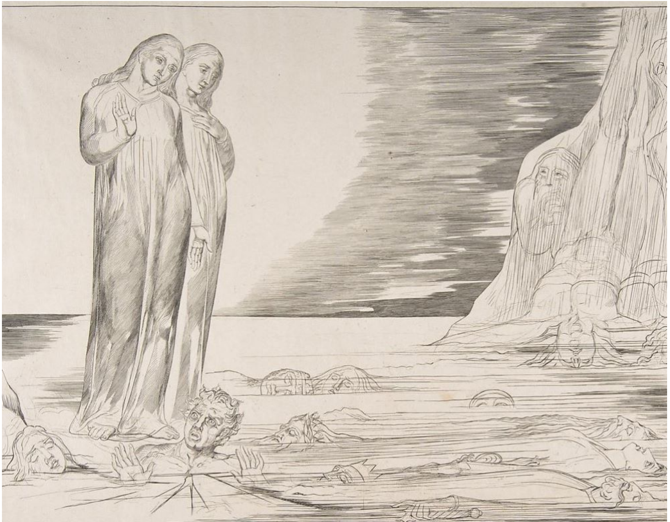
"The Circle of Traitors: Dante's Foot Striking Bocca degli Abbate," engraving by William Blake, ca. 1825-27

When the pandemic began, my siblings and I, who share the caregiving duties for our elderly parents, were separated from them and from each other. My mom called nearly every week with news of another lost friend or relative, none of whom she could say goodbye to or mourn in community. It was painful hearing the catch in my mom's voice over the phone, to not be there for her in person. Then at Thanksgiving, Dad spent a week in the hospital, where he was alone and isolated while being treated with advanced congestive heart failure. He'd been hiding symptoms for weeks for fear of catching COVID in the ER. Dad got better, and he and my mom have so far evaded COVID, but others I know have been less fortunate. One childhood friend lost her father to COVID on Christmas Eve. Another had to say goodbye over FaceTime to her unconscious, COVID-infected grandmother, the