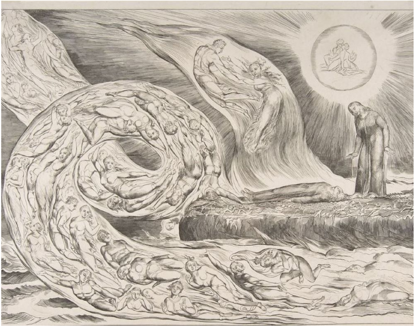
"The Circle of the Lustful: Paolo and Francesca," engraving by William Blake, ca. 1825-27

As with many medieval believers, Dante was heavily influenced by St. Augustine, but his art was hardly the product of monastic-mystical contemplation or Marian visitation. Instead, he was your classic frustrated male poet walking the edge of creepiness with a million chips on his shoulder and an obsession with Beatrice, a local girl he barely knew.