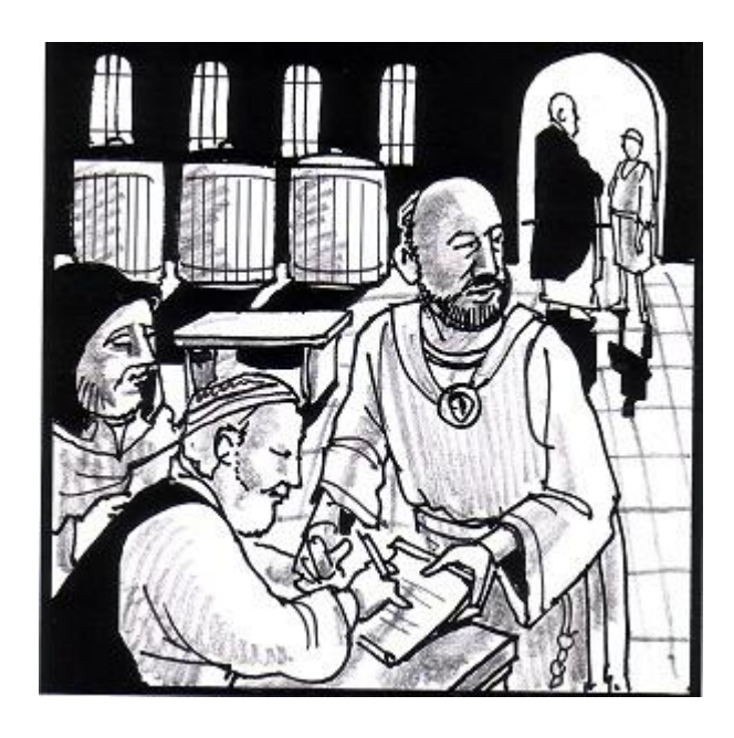
"What is this I hear about you" (Luke 16:2).