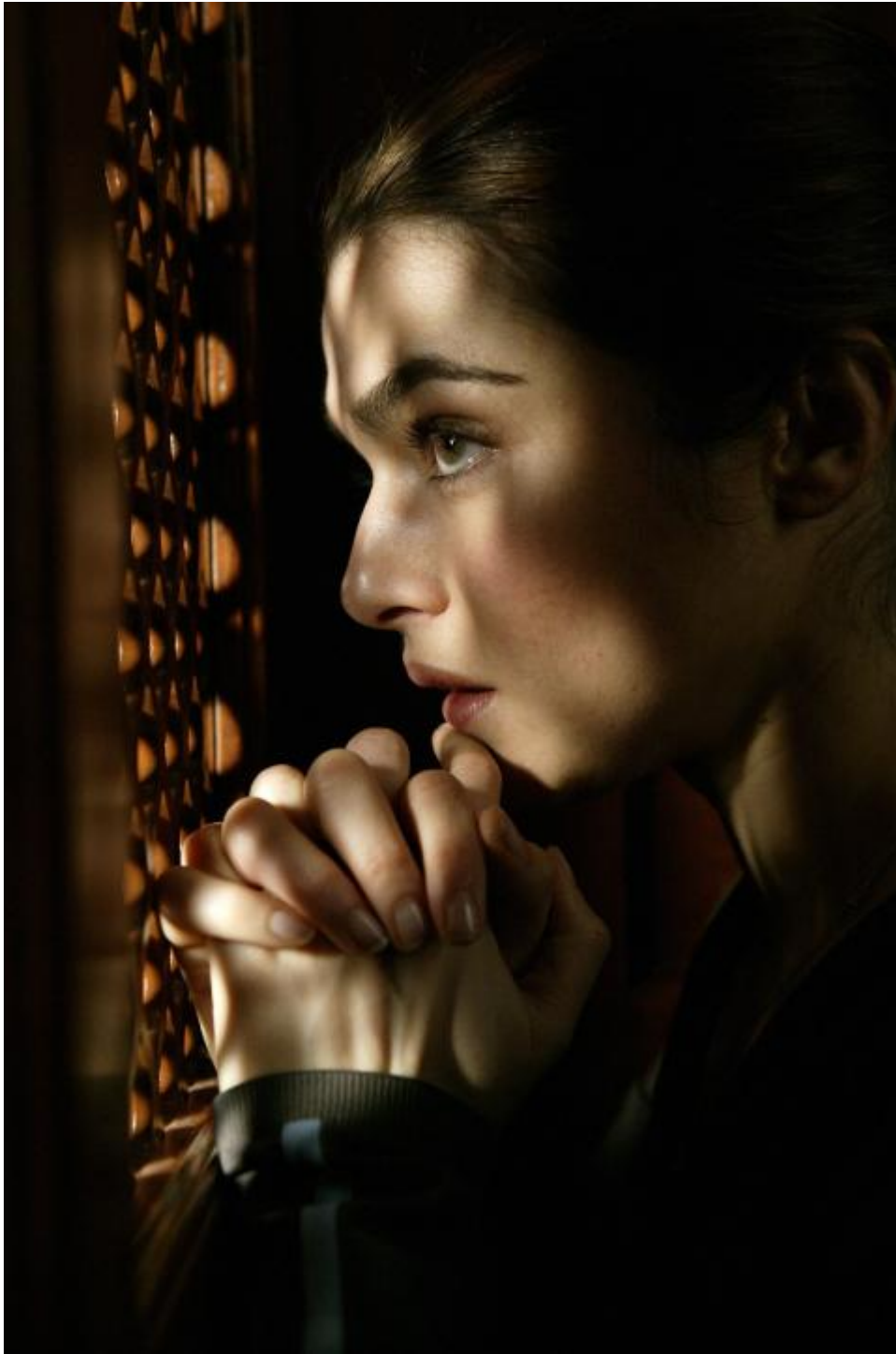
Rachel Weisz in a scene from the 2005 movie "Constantine"