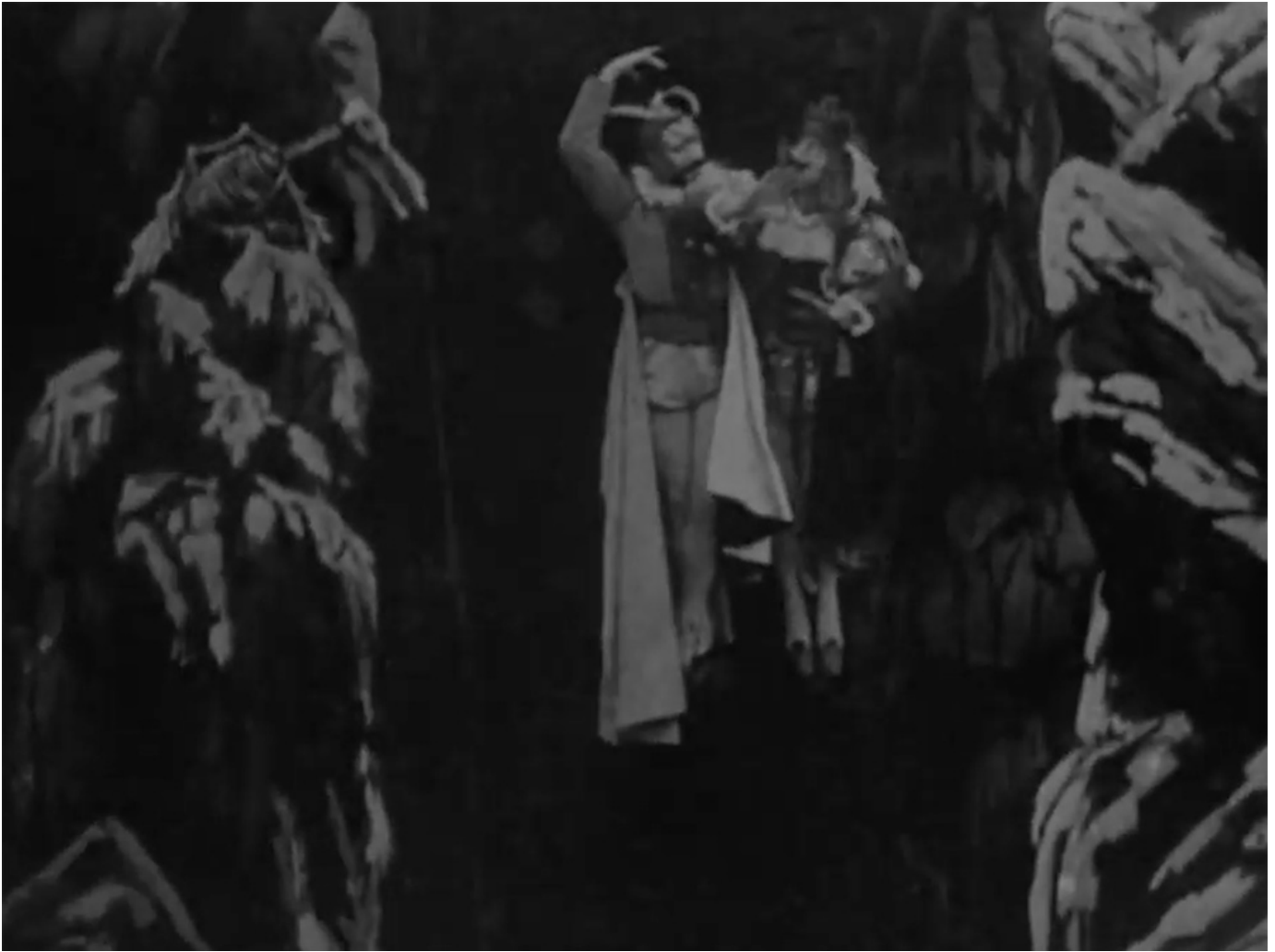
A scene from Georges Méliès' 1903 film "Faust aux enfers," or "The Damnation of Faust"

The films are most mainstream when they take a comedic approach to the devil, such as in " Oh, God! You Devil " (1984), starring George Burns as both God and the devil yet God and the devil come out as we think they are. Horror films can deal with the supernatural, but films about Satan fall within the scope of the religious, theological and spiritual.