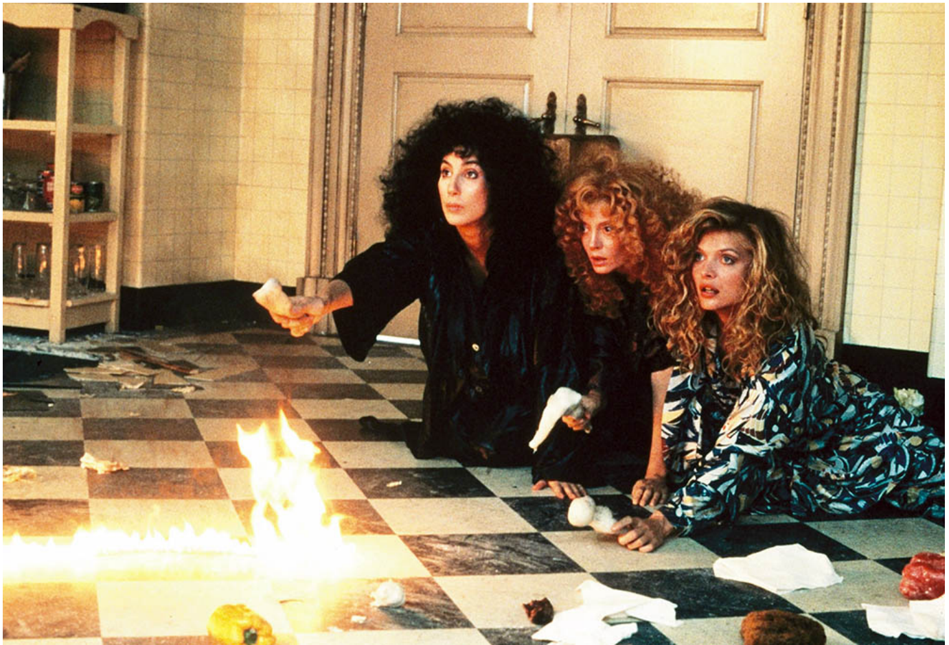
From left: Cher, Susan Sarandon and Michelle Pfeiffer in a scene from the 1987 movie "The Witches of Eastwick"