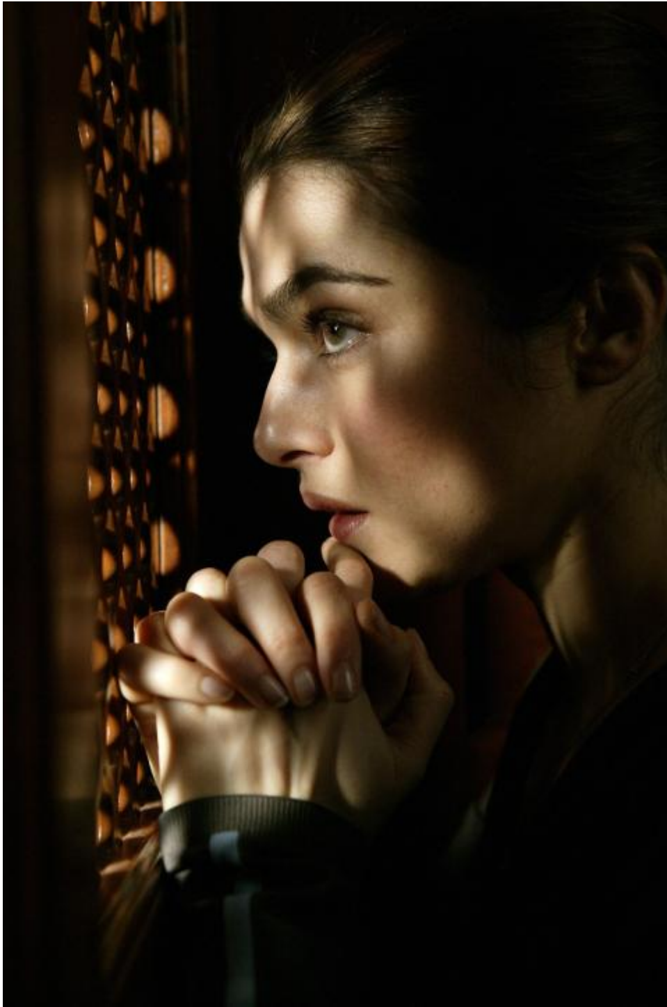
Rachel Weisz in a scene from the 2005 movie "Constantine"