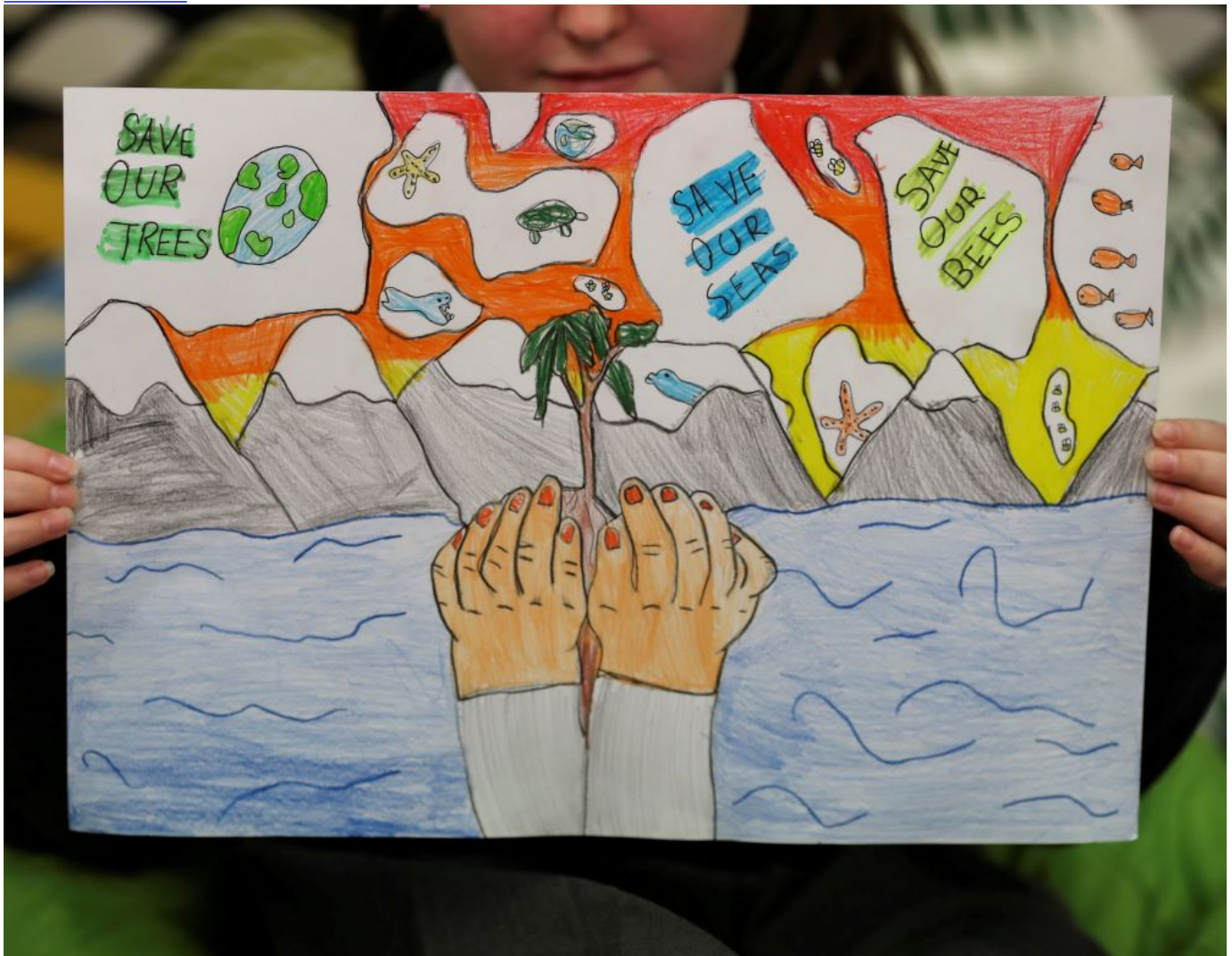
A student holds a poster at St. Conval's Primary School in Glasgow, Scotland, while learning about climate change ahead of COP26, the U.N. Climate Change Conference, which starts Oct. 31.