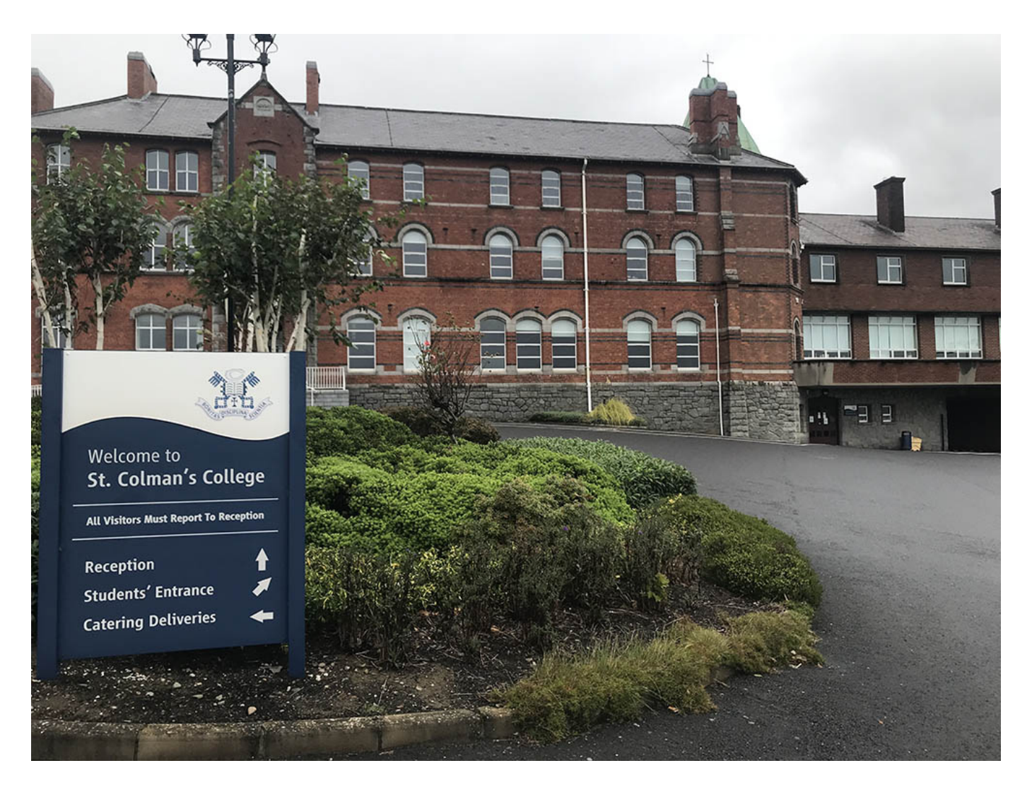
St. Colman's College in Newry, Northern Ireland (Claude Colart)

When the diocese settled a case in favor of a former St. Colman's pupil in 2017, the college <u>condemned the abuse</u> and said it had removed from display all photographs of Finegan.