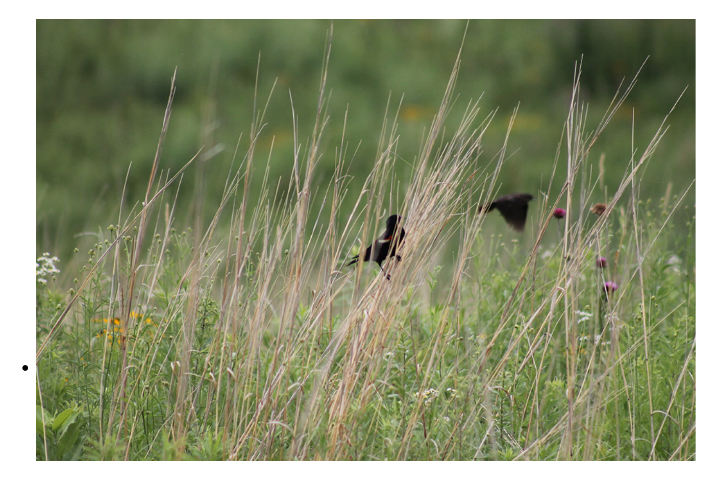
Redwing blackbirds are among the birds and other animals that make their home in the restored prairie.

Within a year, the sisters began discussing a conservation easement. Under such an arrangement, the landowner agrees that the land will not be developed. In turn, the organization overseeing the easement, such as a local land trust, safeguards the land through annual visits.