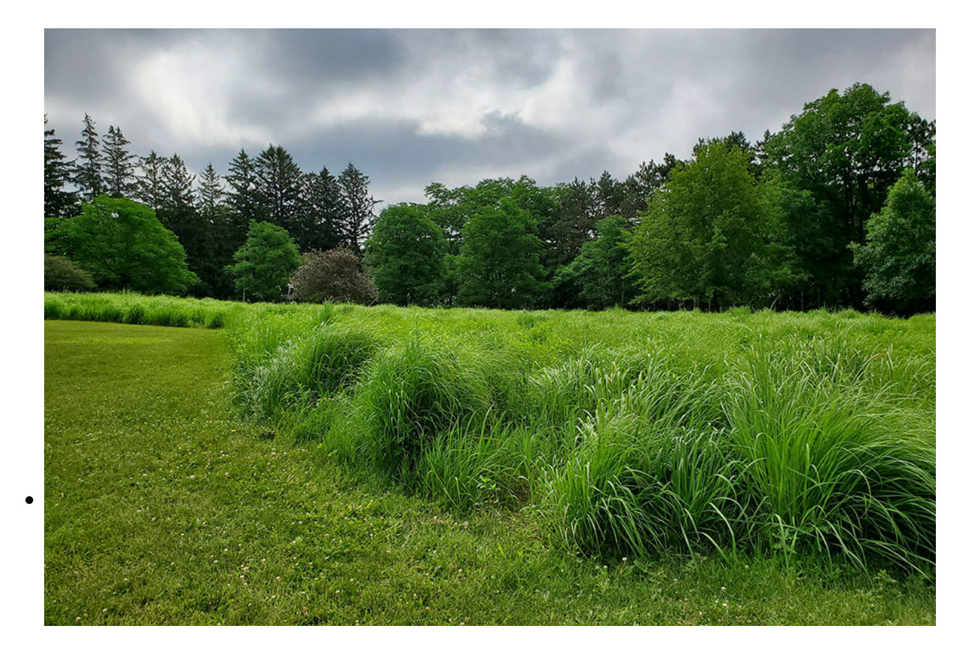
The Sisters of St. Francis of Rochester, Minnesota, placed 72 of their 116 acres of land into a conservation easement.