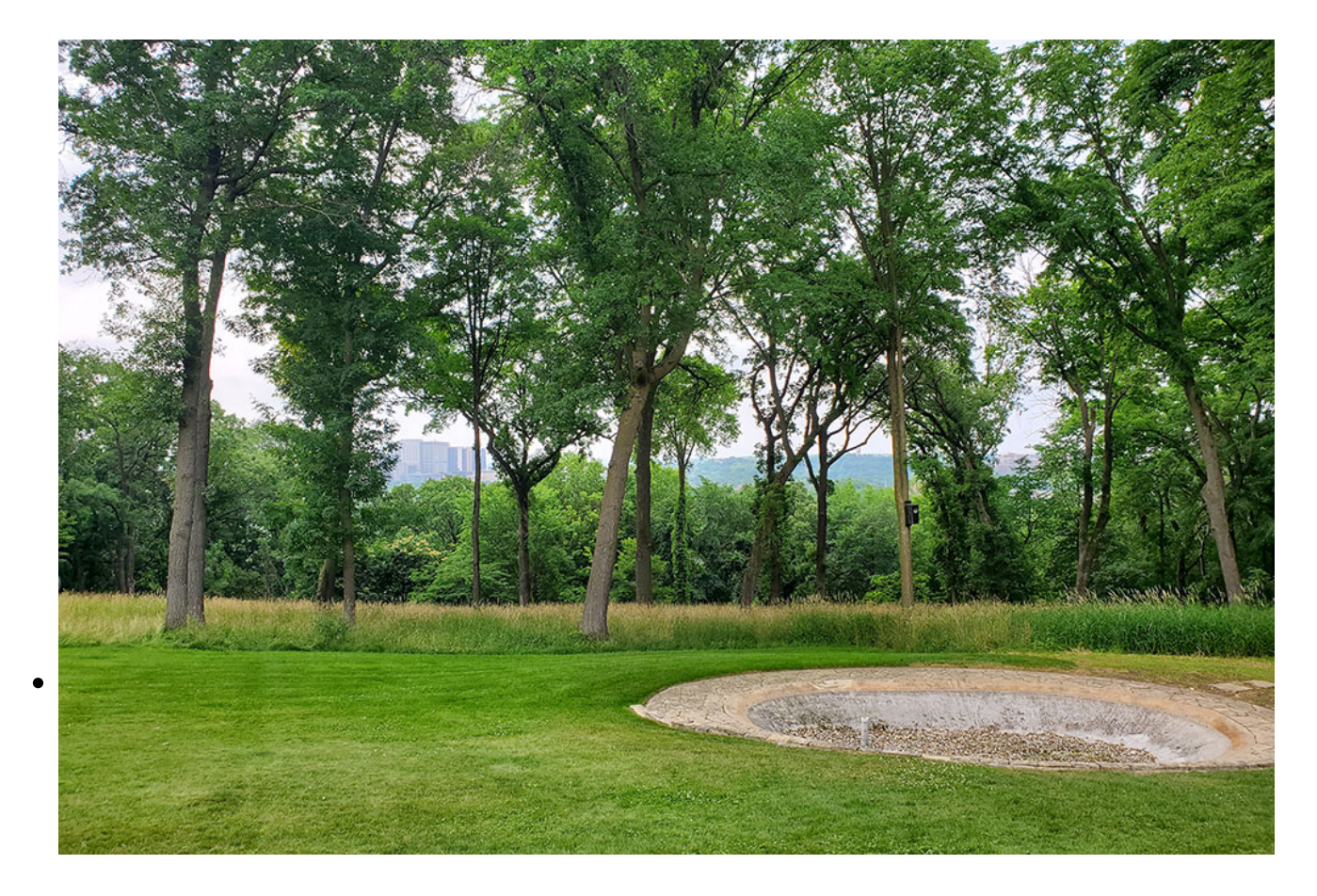
Beyond the Assisi Heights conservation easement, the downtown Rochester, Minnesota, skyline is visible in the distance.

On July 18, 2019, the Rochester Franciscans held a prayer service in their Lourdes Chapel where they announced the easement had been established.