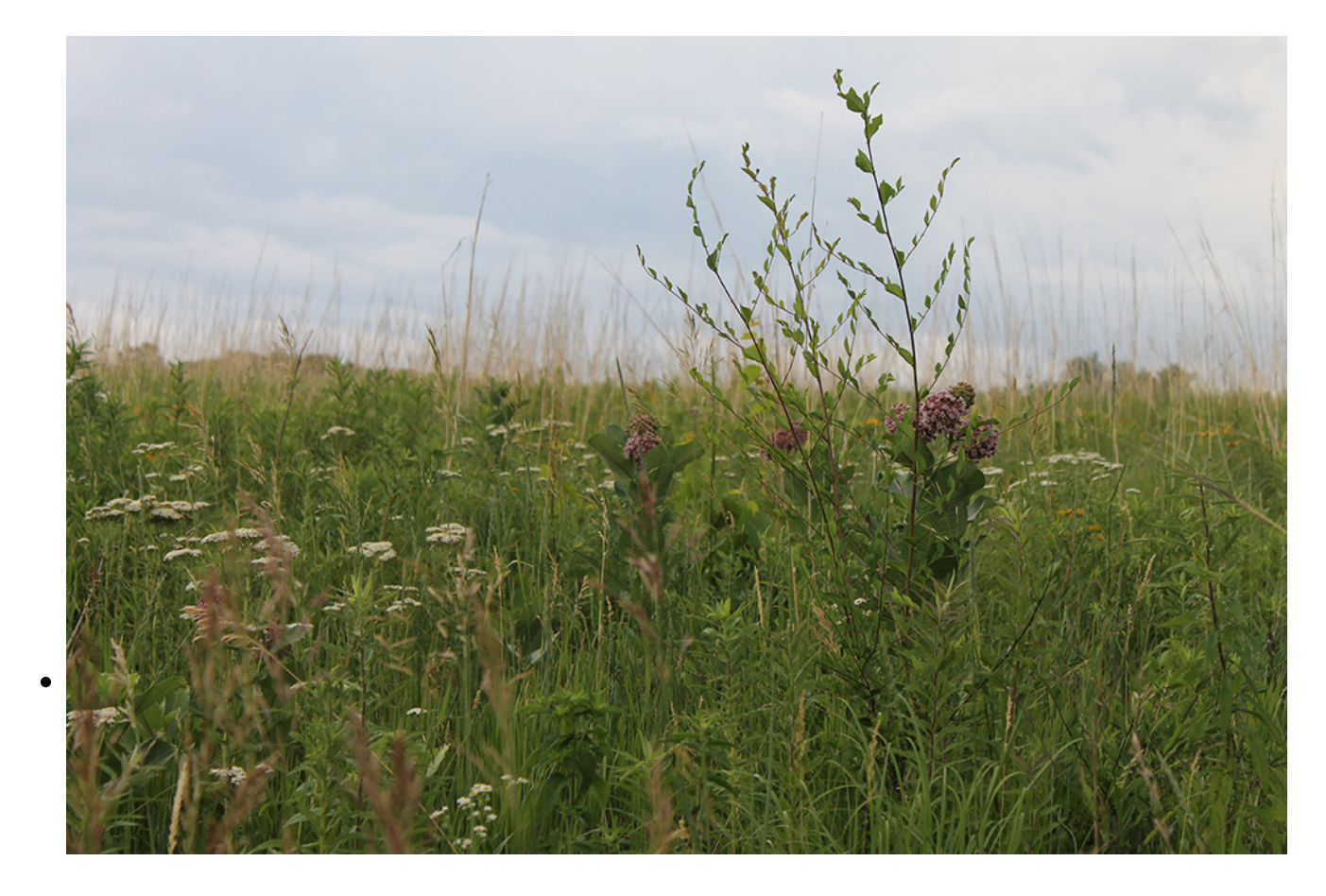
Native prairie grasses grow in the conservation easement established by the Sisters of St. Francis of Dubuque, Iowa.