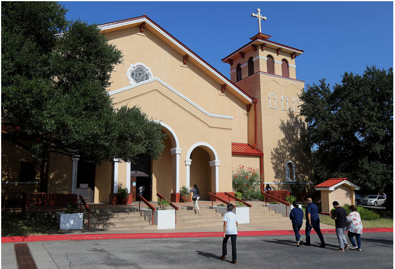
People arrive for Mass at San Jose Catholic Church in Austin, Texas, Sept. 5.

If laity don't like the music, homilies or religious education at one parish, they may "church shop" until they find a more satisfying customer experience, perhaps even relying on online reviews of churches that risk comparing places of worship to restaurants or retail stores.