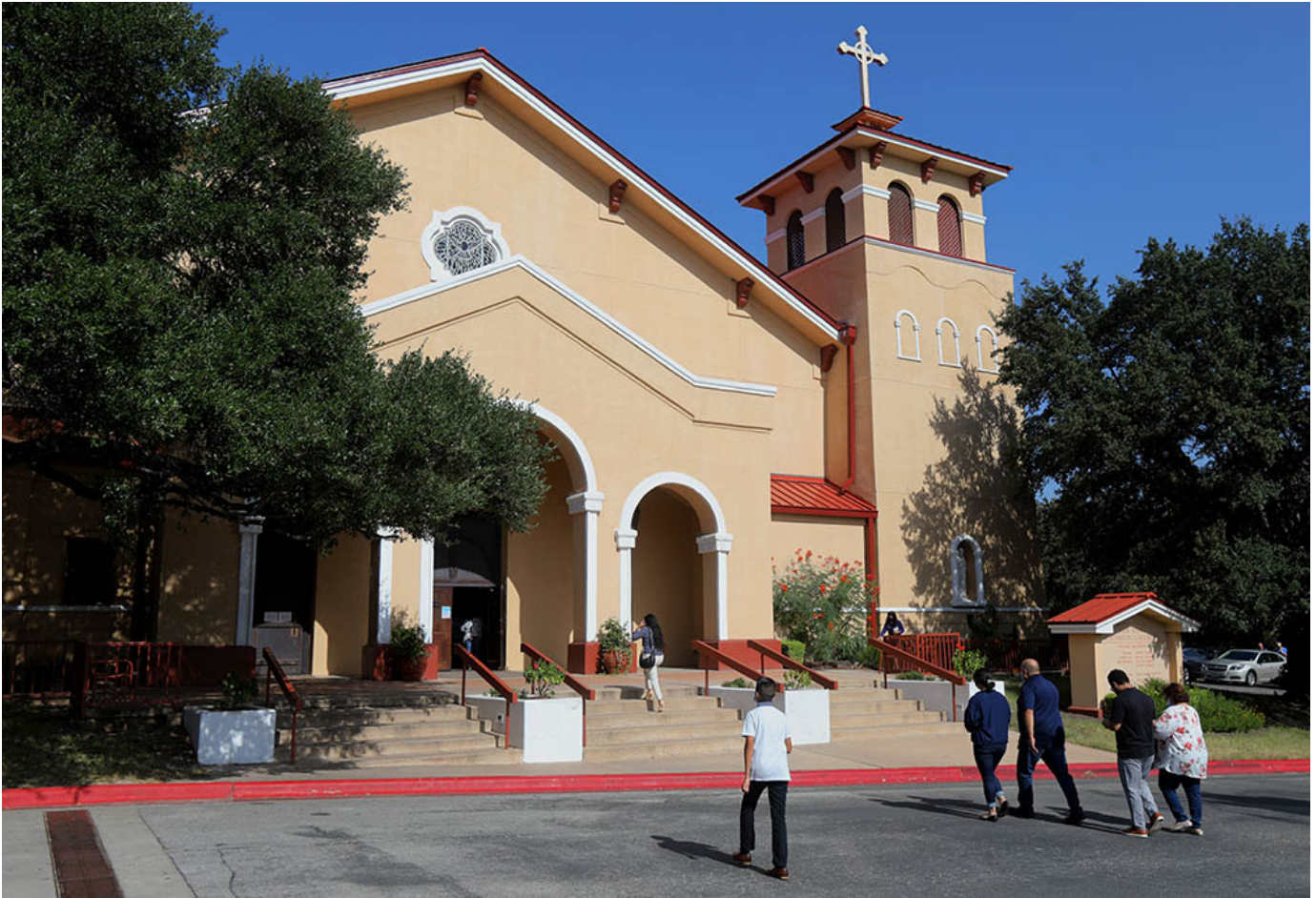
People arrive for Mass at San Jose Catholic Church in Austin, Texas, Sept. 5.

If laity don't like the music, homilies or religious education at one parish, they may "church shop" until they find a more satisfying customer experience, perhaps even relying on online reviews of churches that risk comparing places of worship to restaurants or retail stores.