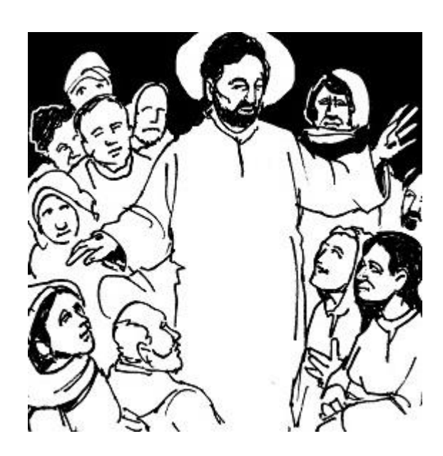
"We shall always be with the Lord" (1 Thessalonians 4:18).