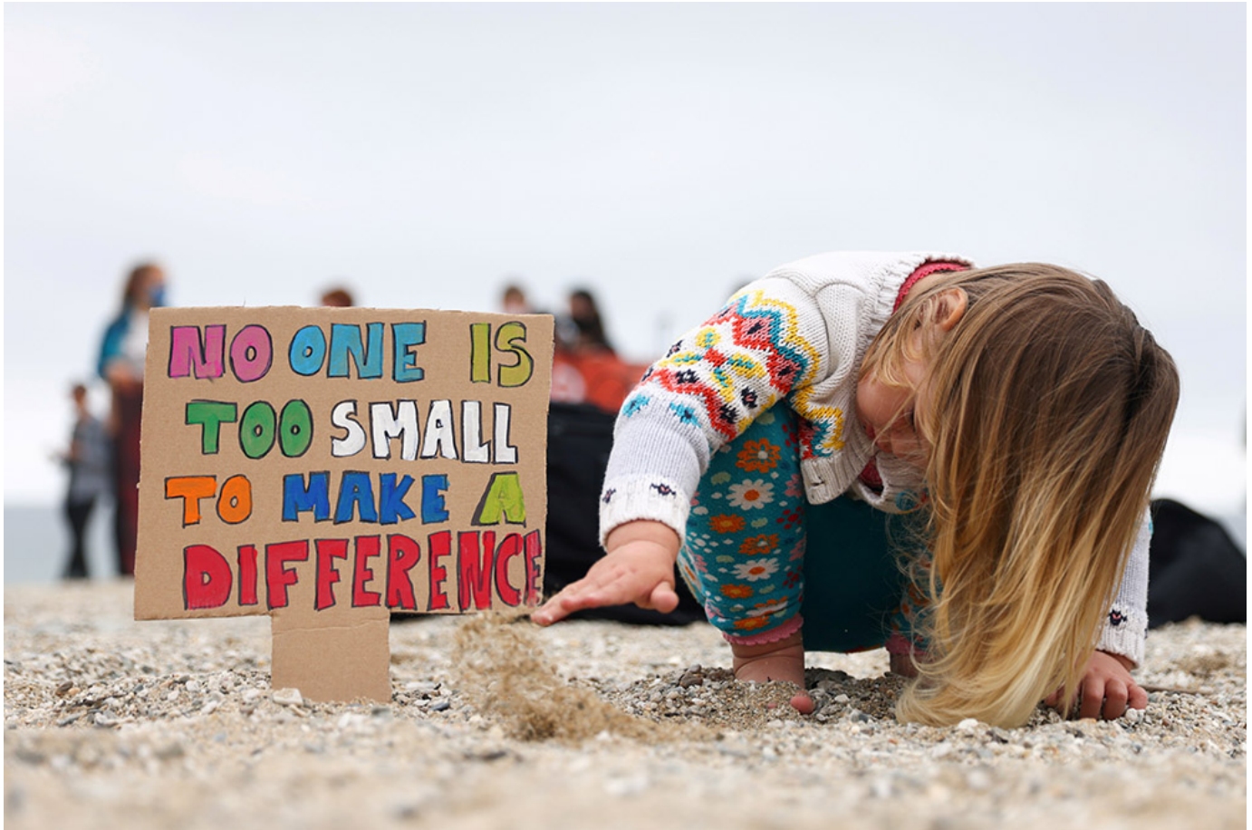
A girl in Falmouth, Britain, plays with sand during a climate protest June 11.