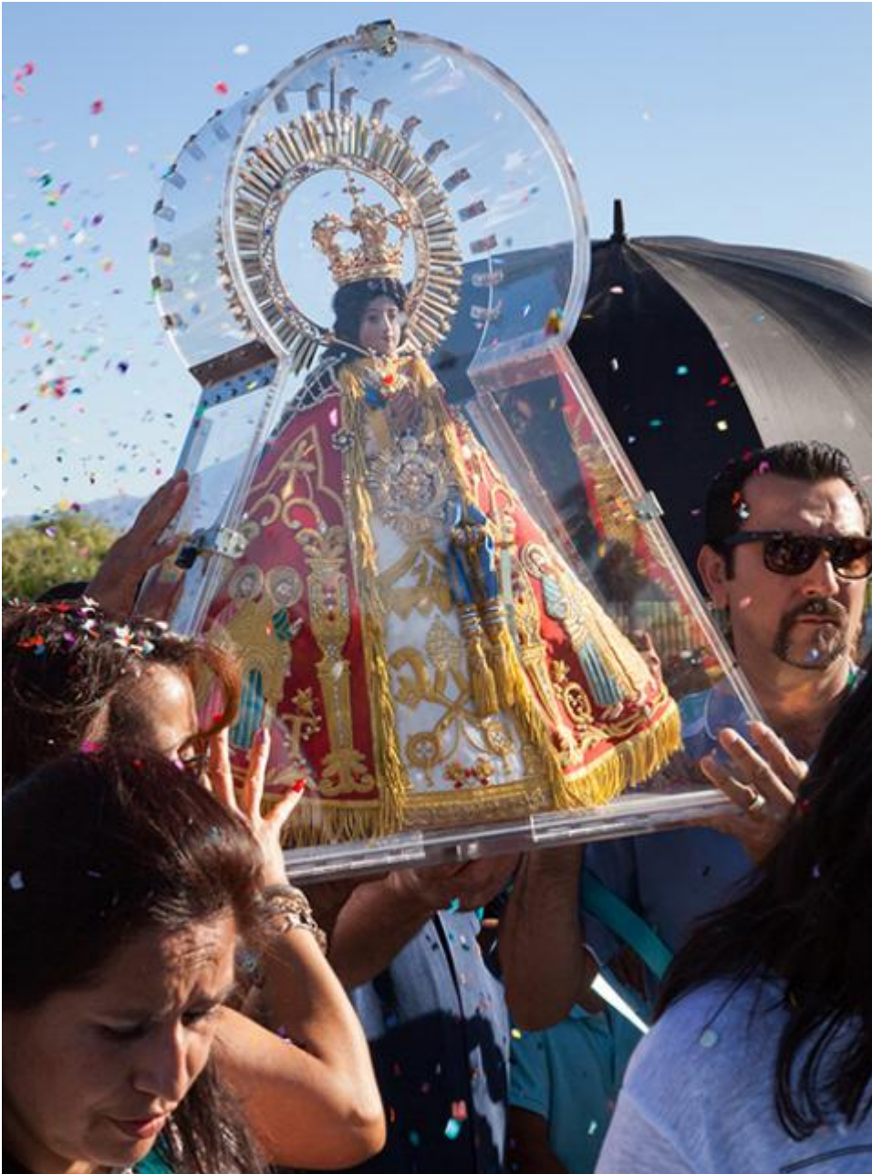
Photo from Noé Montes, an artist who comes from a family of migrant farmworkers, taken in Mecca, California, during an annual visit of La Virgen de Zapopan to the United States in 2015. (Courtesy of Noé Montes)

Rangel said that at the beginning of the pandemic many farmworkers were not given masks or their employers attempted to charge them for personal protective equipment. Others reported that workers were required to bring their own toilet paper to the fields.