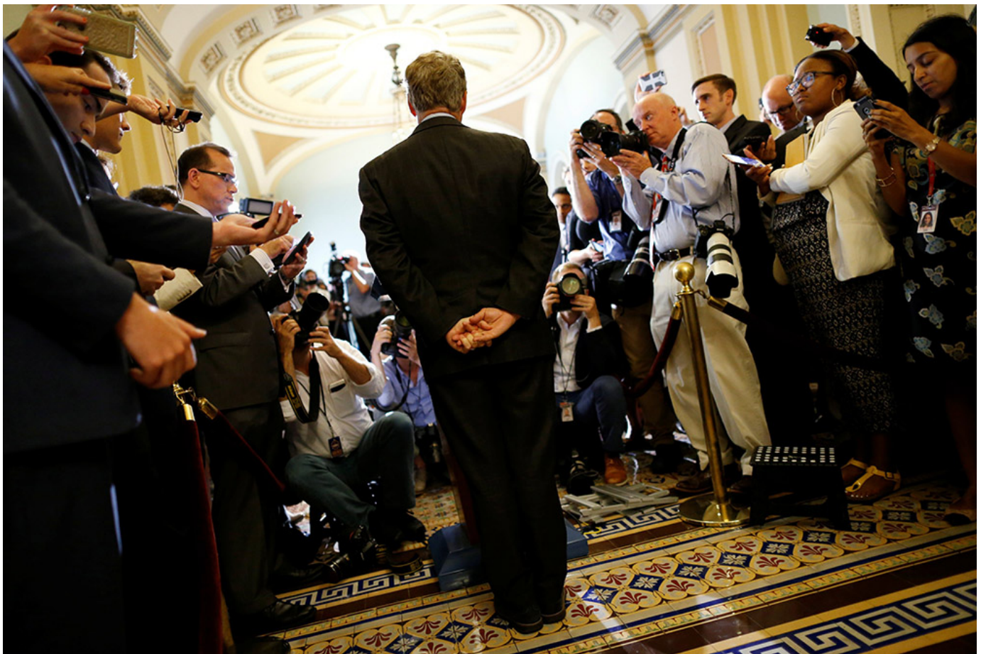
Journalists interview a U.S. senator in this illustration photo.

"They may feel, and it may even be true, that their coverage is absolutely fair," he warned. "But it's also essential to avoid the appearance of a conflict of interest."