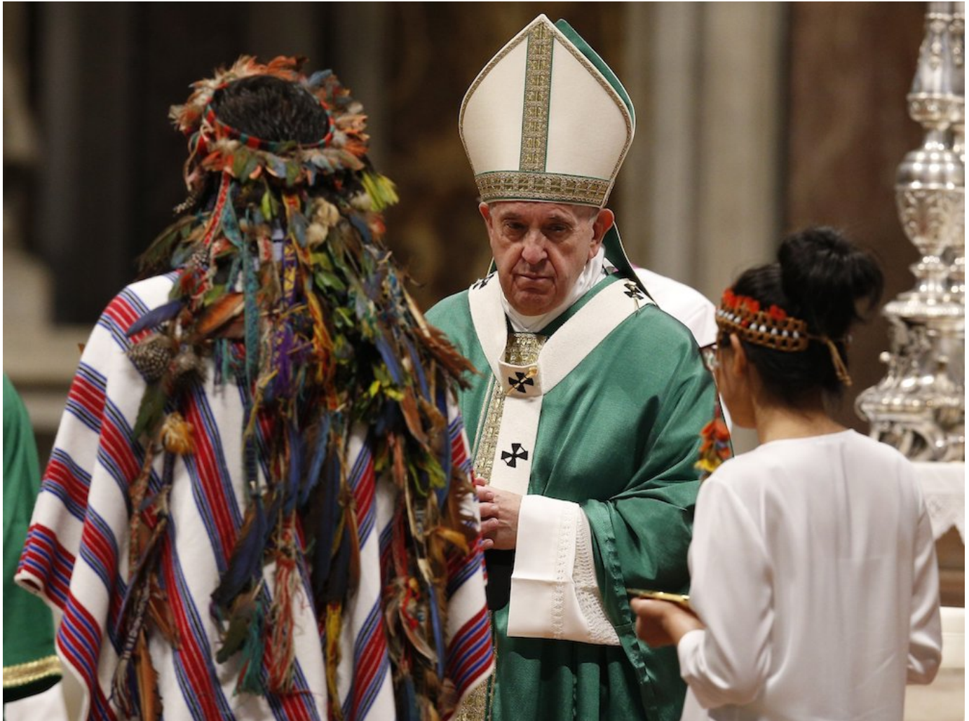
Pope Francis accepts offertory gifts from Indigenous people as he celebrates the concluding Mass of the Synod of Bishops for the Amazon at the Vatican on Oct. 27, 2019.