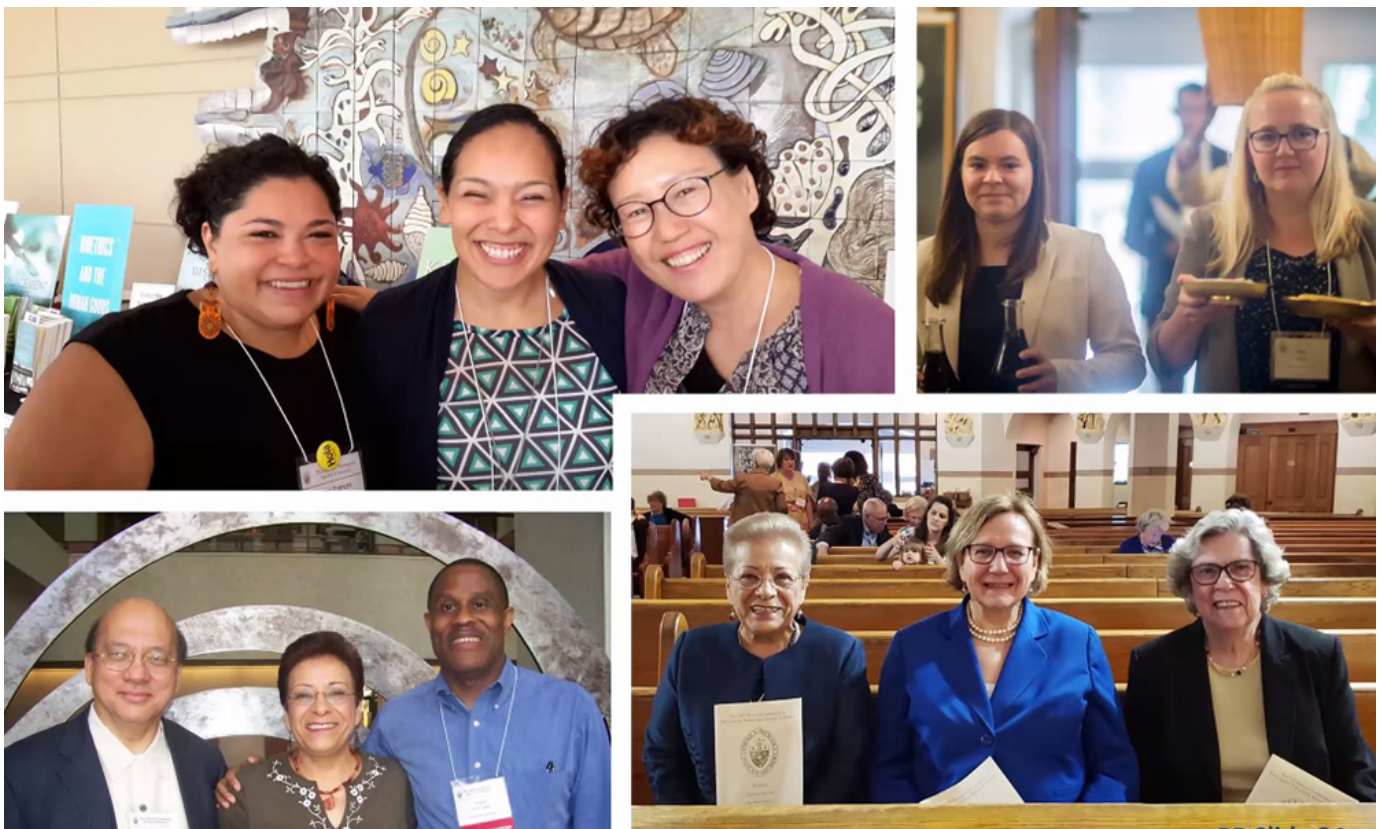
Photos from more recent past conventions of the Catholic Theological Society of America