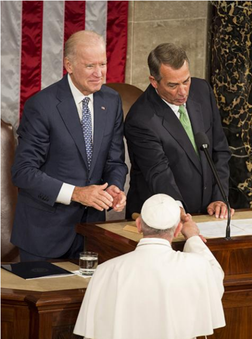
Pope Francis shakes hands with then-U.S. Speaker of the House John Boehner as then-U.S. Vice President Joe Biden looks on during a joint meeting of Congress on Capitol Hill Sept. 24, 2015, in Washington.

When Boehner told them he had invited the Polish pope to address Congress as a head of state, it seemed to put them at ease a bit. Pope John Paul II never accepted his invitations, but fast forward 20 years later, Boehner still gets weepy talking about that September day when Pope Francis arrived at the Capitol.