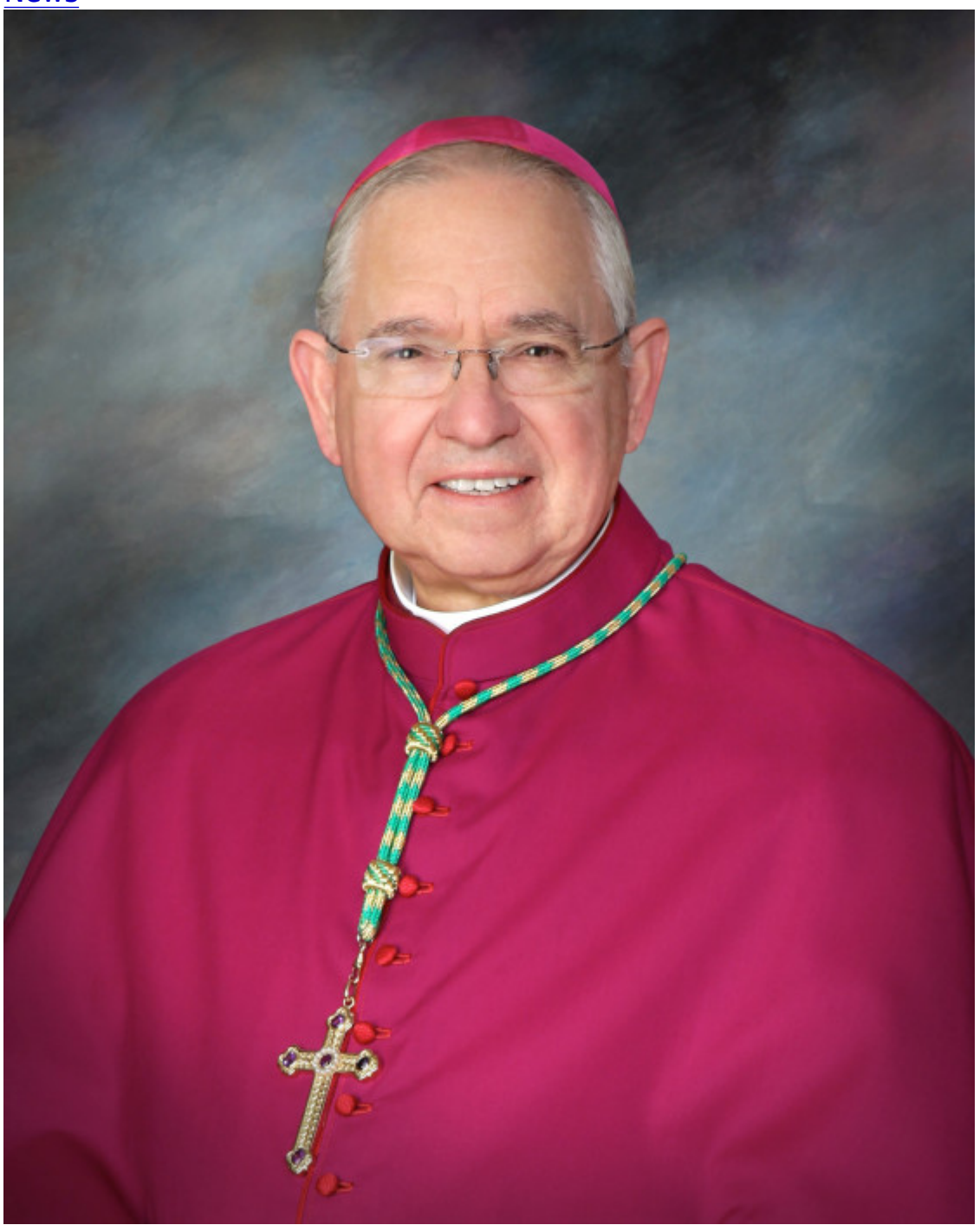
Archbishop José H. Gomez of Los Angeles, president of the U.S. Conference of Catholic Bishops, is seen in this Nov. 20, 2019, file photo.