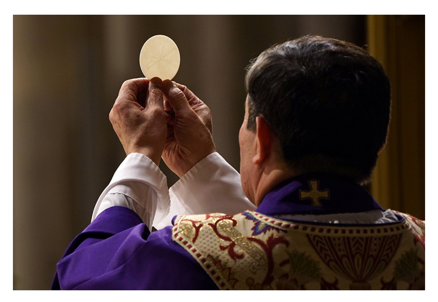
A priest elevates the host in a 2020 file photo.