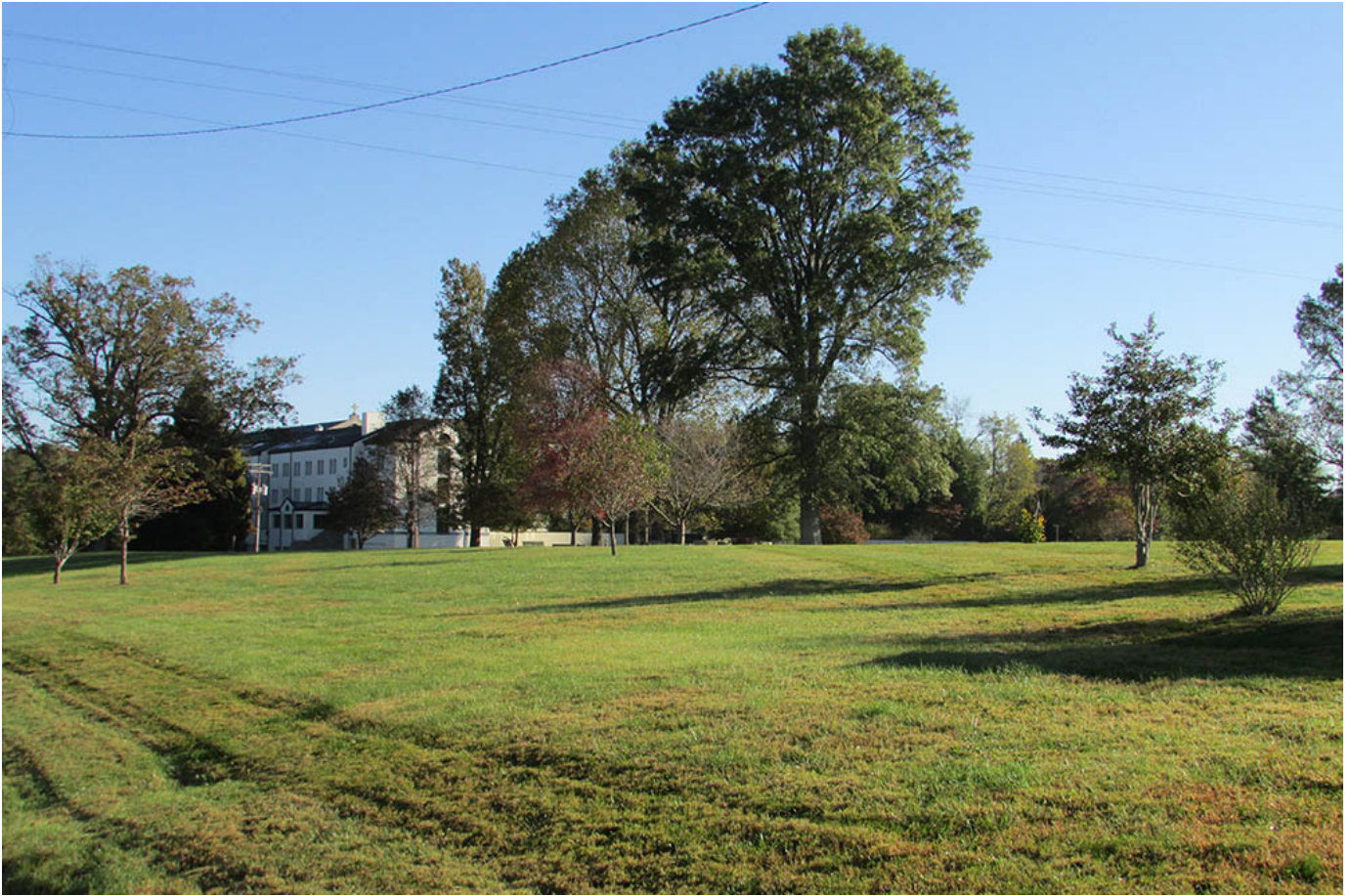
The Abbey of Gethsemani in Trappist, Kentucky

He thought about leaving for a different monastic order, the Camaldolese, in which the monks lived in solitude as hermits. His superiors tried to assuage his desire to leave by allowing him solitary spaces for his writing and reading. But then, unexpectedly, about a month after his ordination to the priesthood, Merton writes that on June 27, 1949, "Reverend Father ... gave me permission to go out of the enclosure into the woods by myself."