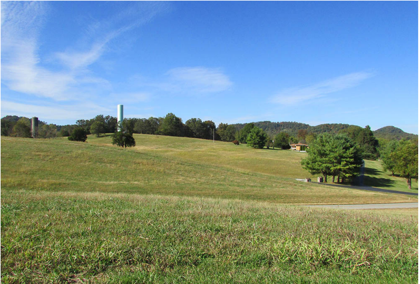
A field at the Abbey of Gethsemani, Kentucky