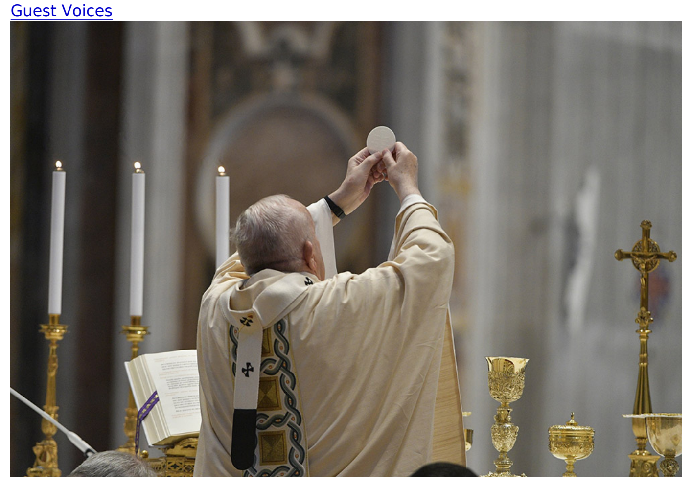
Pope Francis elevates the Eucharist during Easter Mass in St. Peter's Basilica at the Vatican April 4.