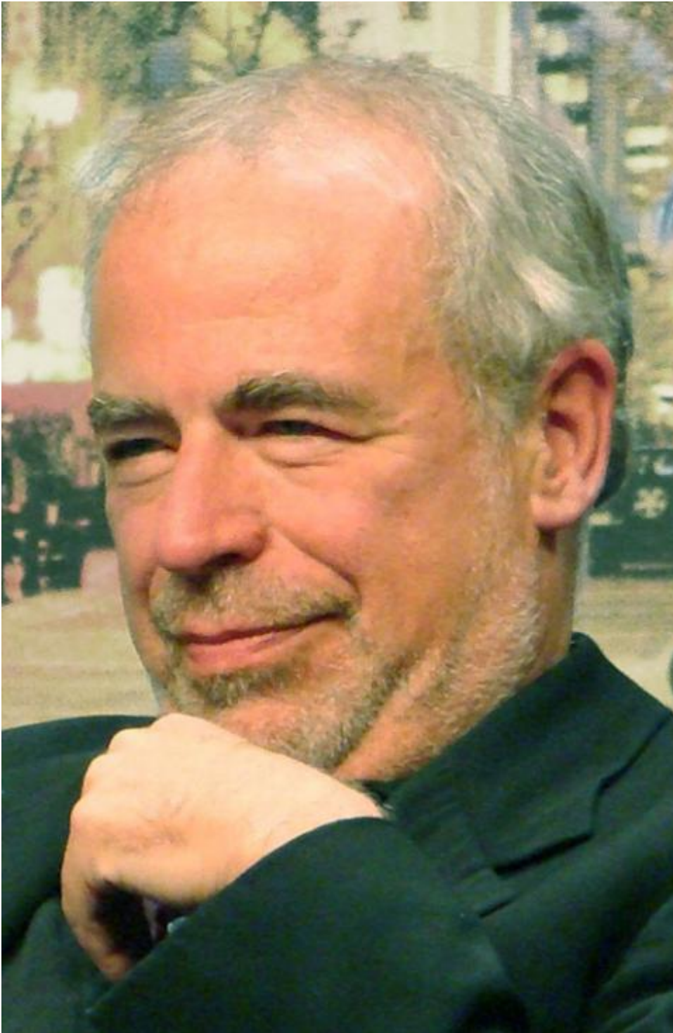
Richard Russo in 2008

Many of his characters, meanwhile, still carry a faith brought from the Old World to Manhattan, or Albany, or Rochester, before it settled in the central New York towns Russo has made his own.