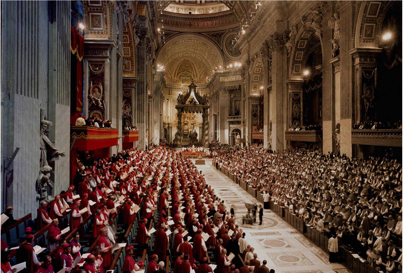
Bishops fill St. Peter's Basilica during a meeting of the Second Vatican Council.