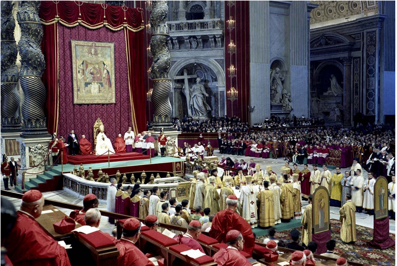
Pope Paul VI presides over a meeting of the Second Vatican Council in St. Peter's Basilica at the Vatican in 1963.

The history of the magisterium teaches us that not all changes are ruptures, and not all material continuities with the previous tradition ensure continuity with the Gospel. It is also misleading to say that "the same magisterium that gave us the ecumenical council of Vatican II also gave us Pope Benedict XVI's motu proprio [ Summorum Pontificum on the 'traditional Latin Mass']," almost implying that the teaching of a general council like Vatican II and the motu proprio of a pope are on the same level of authority.