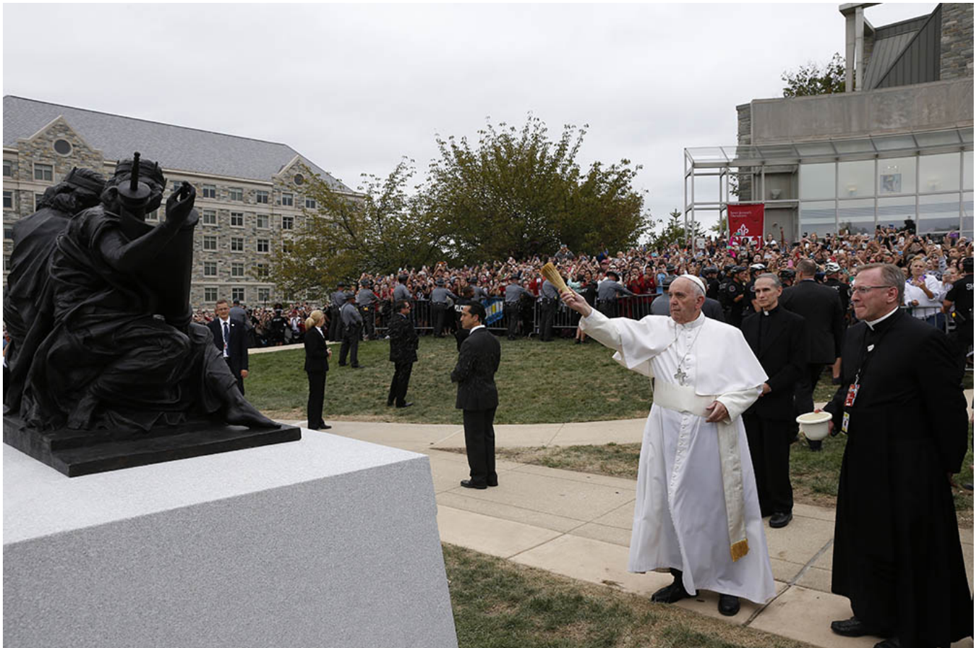
At St. Joseph's University in Philadelphia Sept. 27, 2015, Pope Francis blesses a sculpture commemorating the 50th anniversary of "Nostra Aetate," the Second Vatican Council Declaration on the Relationship of the Church to Non-Christian Religions.

Moreover, if in the theological interpretation of Vatican II one does not include the discontinuities of documents like Dignitatis Humanae on religious liberty and Nostra Aetate on non-Christian religions, the whole "good Catholic conservatives vs. progressives as false prophets" narrative becomes a caricature.