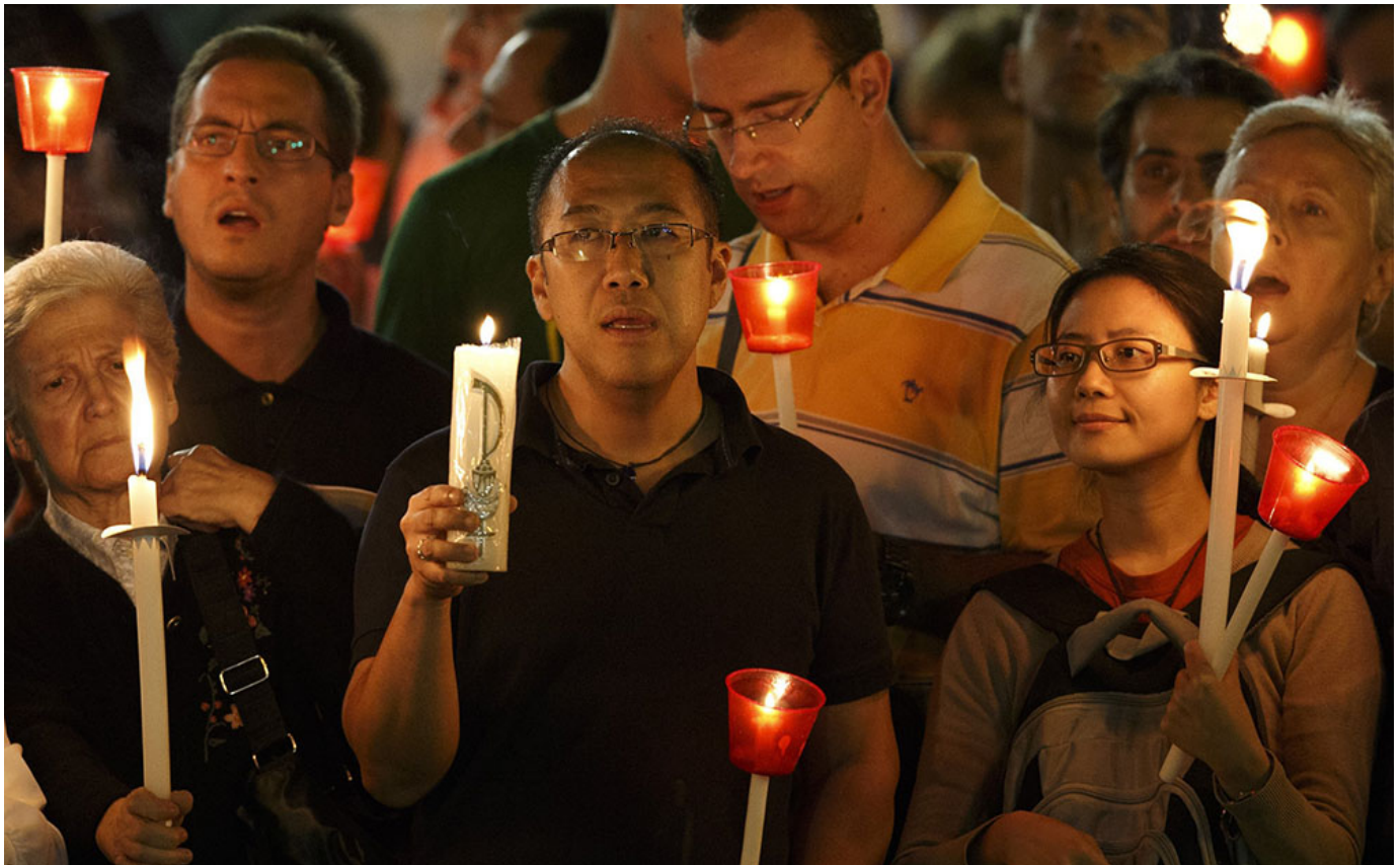
Pilgrims attend a candlelight vigil in St. Peter's Square at the Vatican Oct. 11, 2012, to mark the 50th anniversary of the opening of the Second Vatican Council.

The problem is that the texts of Vatican II are not just the four constitutions presented in this volume: There are 12 more of them. Someone who would start to learn about Vatican II from this volume would have no way of knowing that. It is true that the four constitutions belong to a higher category of conciliar teachings, but this assumption has been relativized in the post-Vatican II period, and not just by progressive theologians, but also by popes, if one looks, for example, at the role of the declaration Nostra Aetate on non-Christian religions in the pontificate of Pope John Paul II (not to mention Francis).