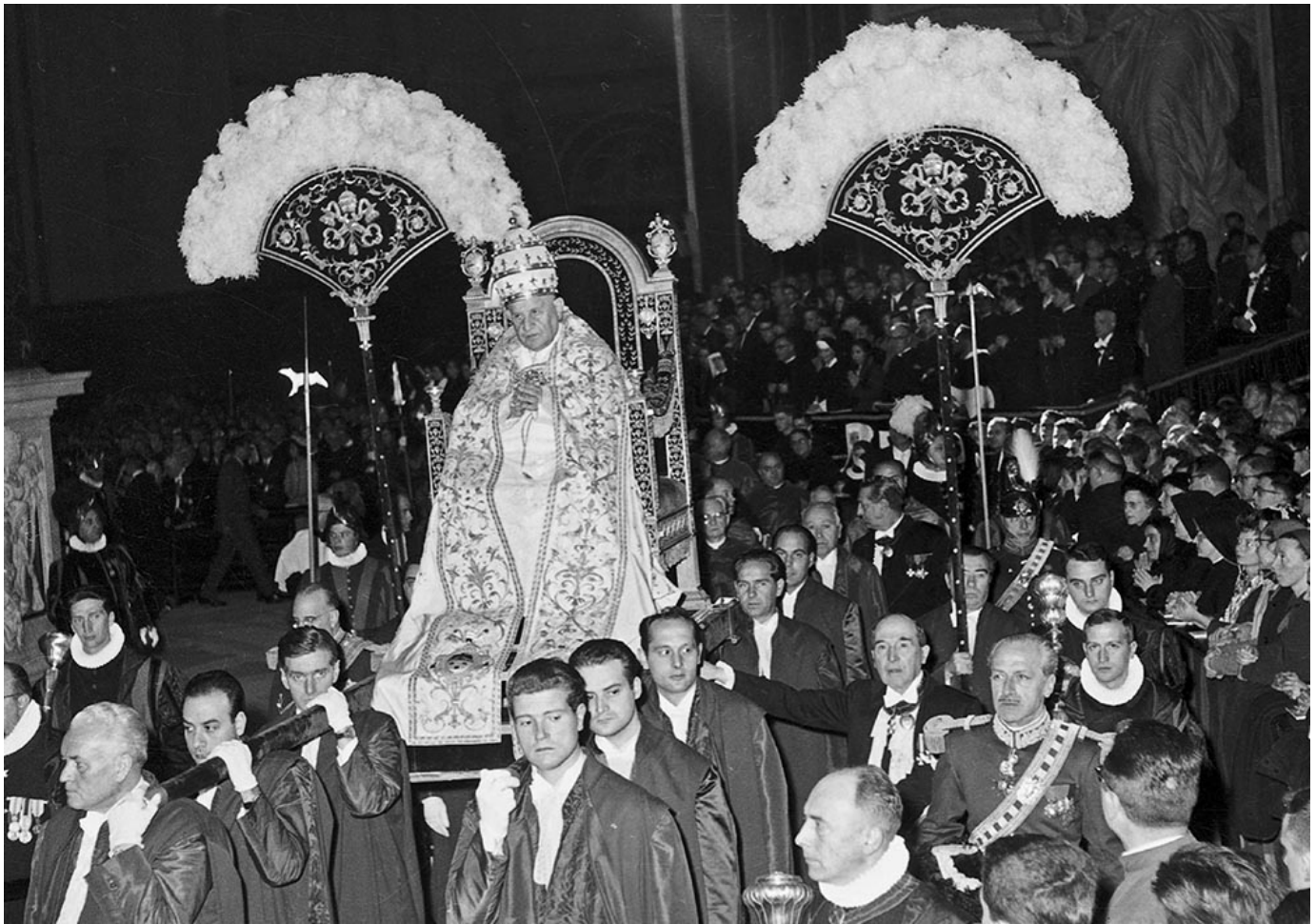
Pope John XXIII leads the opening session of the Second Vatican Council in St. Peter's Basilica Oct. 11, 1962.

Other choices made by Barron are less convincing, for example, the decision to publish the texts of the four constitutions in English using the official Vatican translation (which is available also online for free). It is true that there is still no consensus on which English translation is the best one, the last one (by Austin Flannery in 1996 ) now more than 25 years old. But the Vatican translation is notoriously a little careless in some passages, besides sounding evidently gender noninclusive (more in English than in the original Latin).