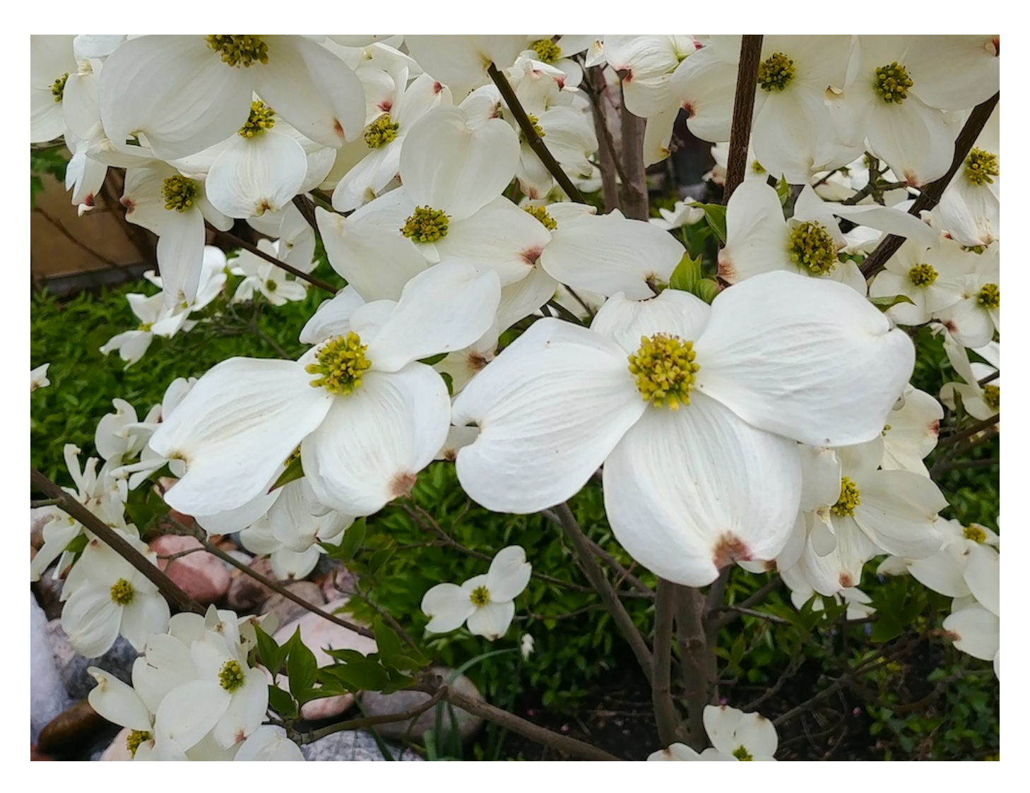
Dogwood trees flower in the spring, but they have many different seasons of beauty. (Tracy Abeln)