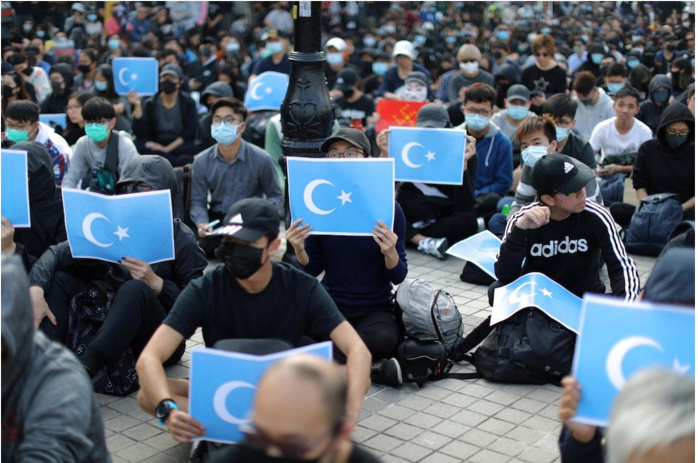
Hong Kong protesters hold East Turkestan Uighur flags at a rally in support of Xinjiang Uighurs' human rights, in Hong Kong Dec. 22, 2019.