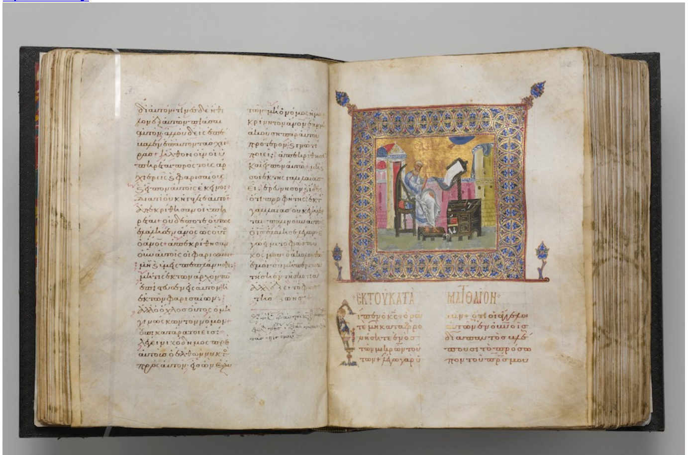
Jaharis Byzantine Lectionary, circa 1100 and made in Constantinople, open to folio 43 showing the evangelist Matthew (Metropolitan Museum of Art)

Opinion Spirituality Vatican Columns Spirituality