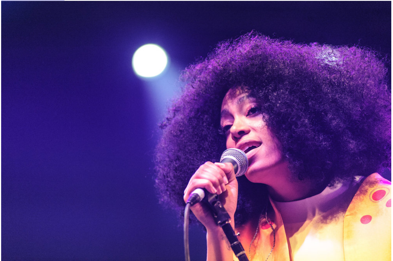
Solange performing at the Coachella Valley Music and Arts Festival in 2014