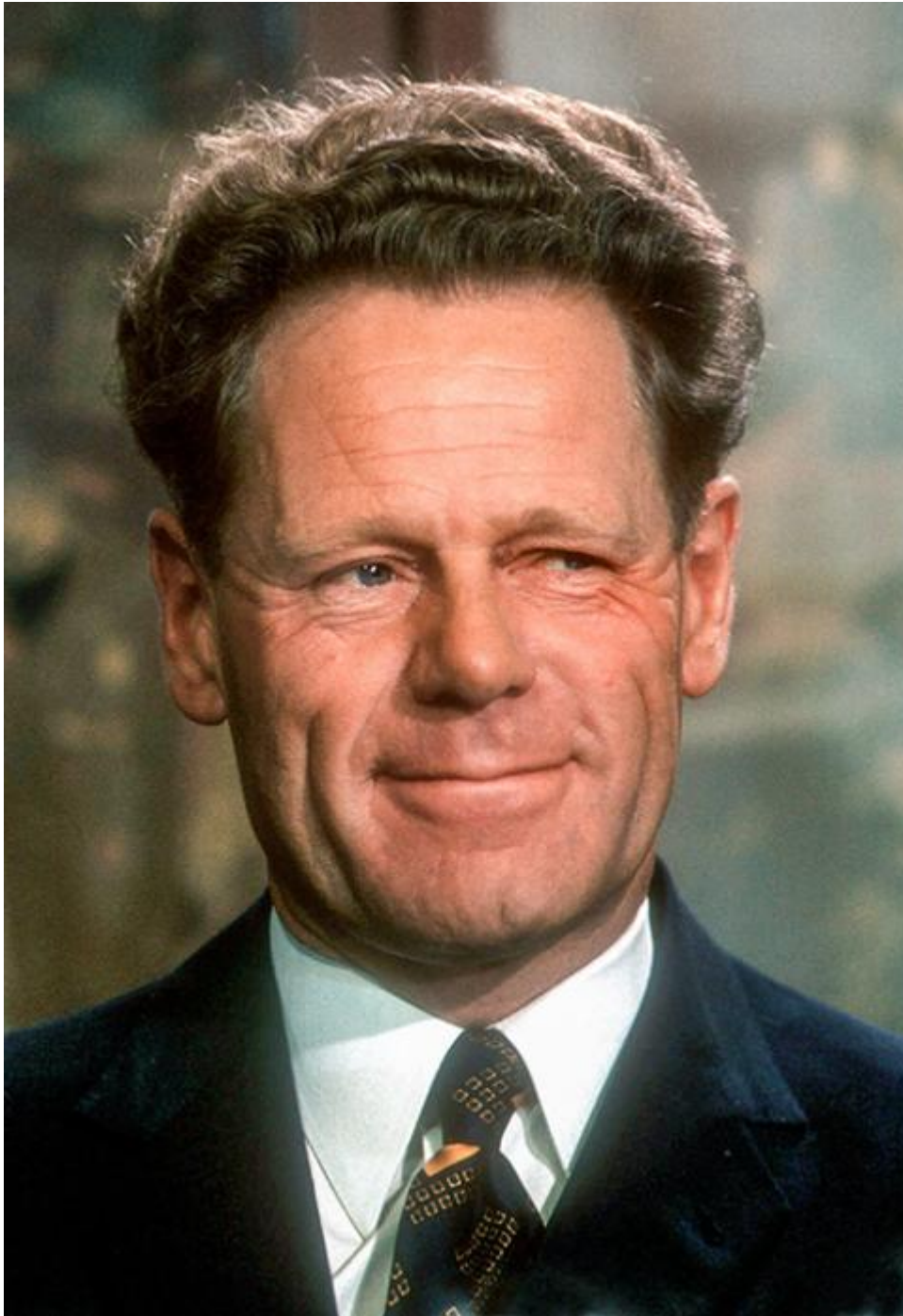
Fr. Hans Küng in 1974

In his most popular book — Christ sein (On Being a Christian) — which quickly sold more than 200,000 hard covers in German alone when it was released in 1974, Küng said he probed theological issues that are of concern to any educated person. He wrote for those "who believe, but feel insecure," those who used to believe "but are not satisfied with their unbelief" and those outside the church who are unwilling to