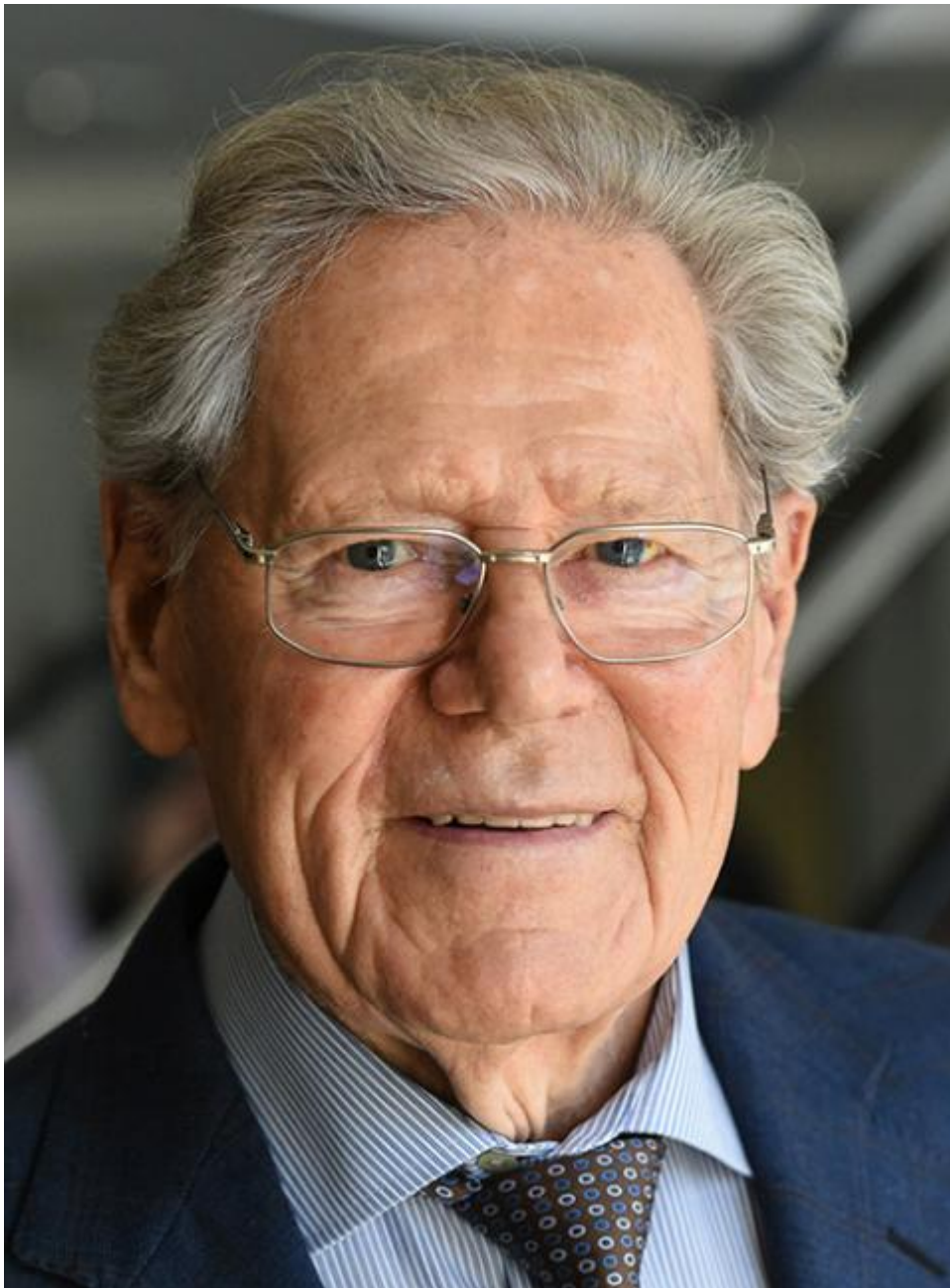
Fr. Hans Küng in 2015

None of this would have happened had he not had his teaching license withdrawn in 1979, he later admitted.