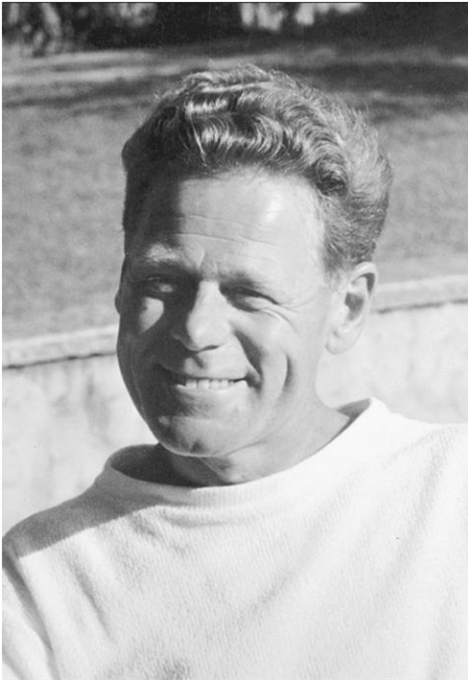
A younger Fr. Hans Küng is seen in an undated photo.

Not only did progressive bishops seek out Küng's acumen and writing skills, but his fluency in French, Italian, Dutch, German, English and Latin made him the go-to guy in dealing with the press. He was quick to publish his views on council texts and backroom maneuvering in leading papers and was a frequent television guest, remembered as much for his good looks and business suits as for his expertise.