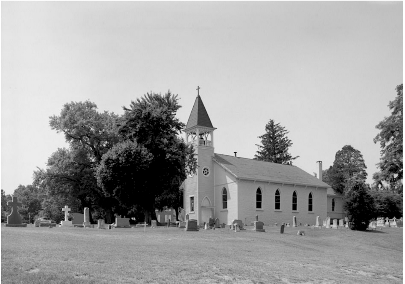
Sacred Heart Church at Whitemarsh in Bowie, Maryland, built around 1741

From 1833 until the meeting of the First Plenary Council of Baltimore in 1852, the metropolitan and each of his suffragans drew up a list of three names, a terna, for each vacant see, and the ternas were sent to both the metropolitan and the Propaganda Fide office in Rome, as the United States was still considered mission territory. The bishops included their reasons for the names given, but the ternas were only recommendations, and the final terna to be brought to the pope was drawn up by the cardinal members of Propaganda Fide.