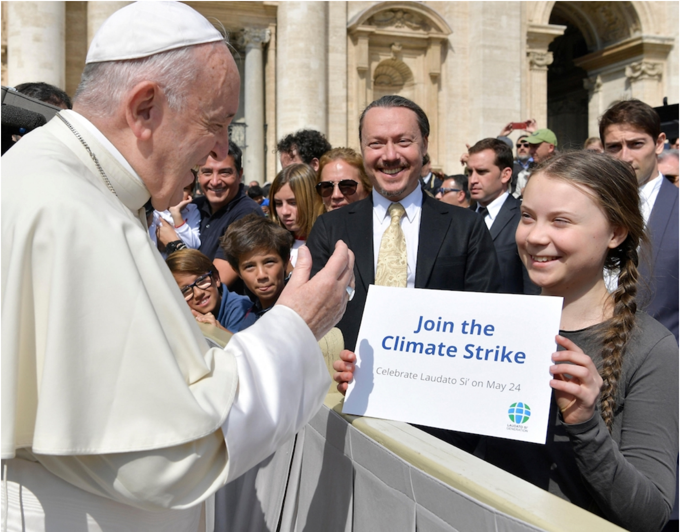
Pope Francis greets Swedish climate activist Greta Thunberg during his general audience in St. Peter's Square at the Vatican April 17, 2019.