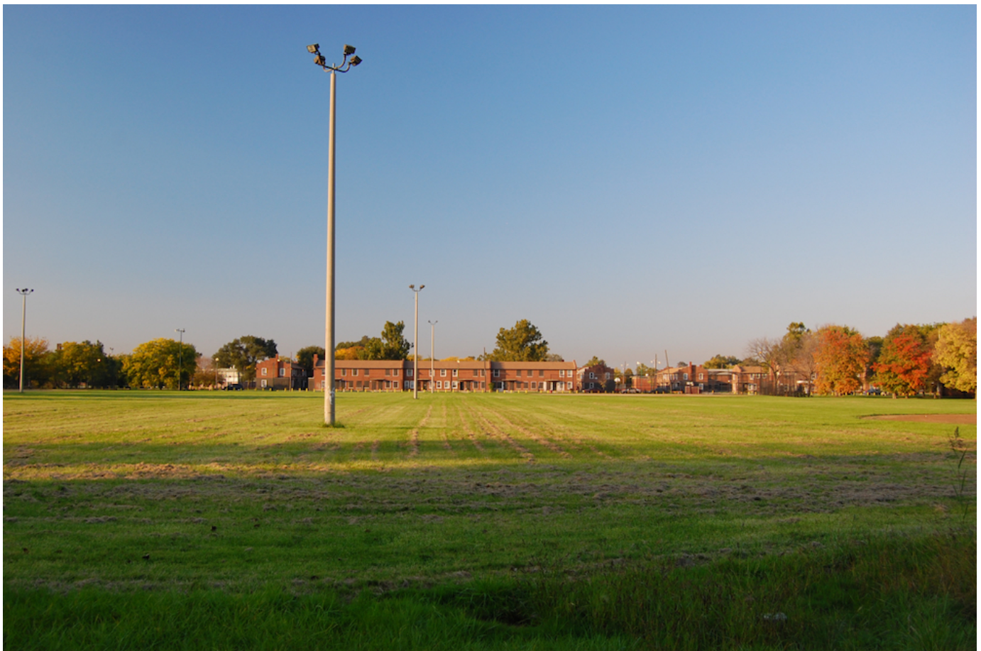
Altgeld Gardens housing units pictured Oct 11, 2008

One protest in 1987 blocked CID Waste Management dump trucks from entering a landfill, while other actions tried to convince government officials to cancel permits for landfills and contaminated lagoons. They challenged the Chicago Housing Authority for its own pollution, use of asbestos and toxic dumping.