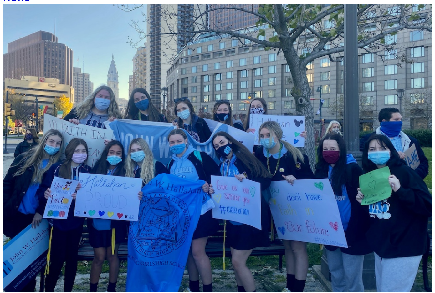
John W. Hallahan Catholic Girls' High School students participate in a Nov. 20, 2020, school walkout to protest the archdiocese's decision to close their high school.