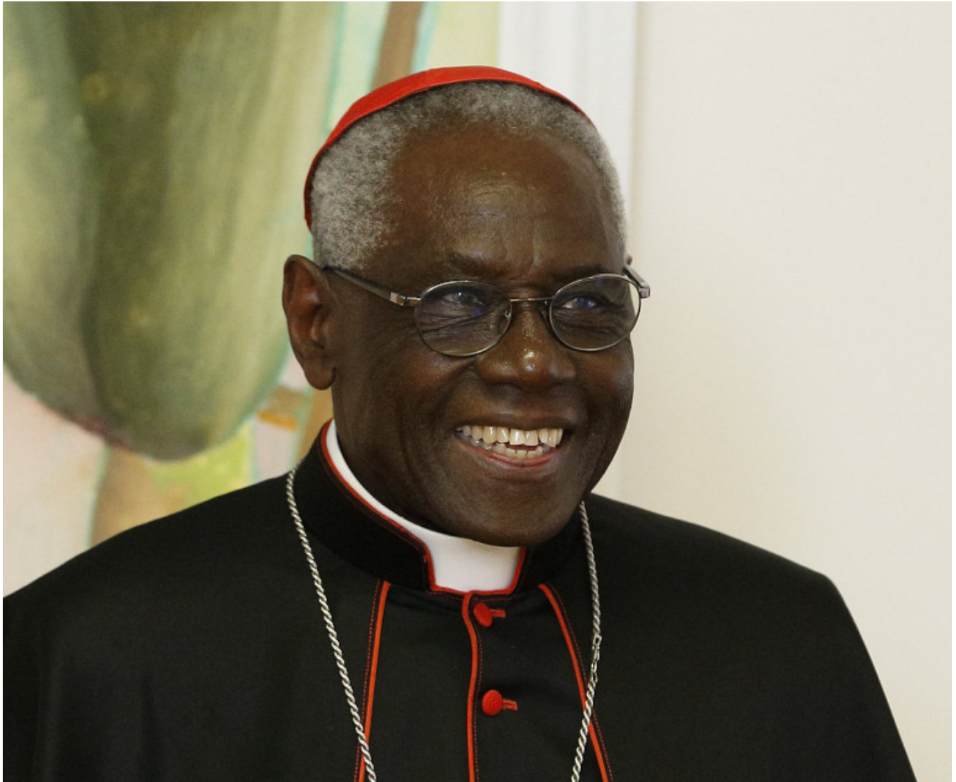
Cardinal Robert Sarah, former head of the Congregation for Divine Worship and the Sacraments, is pictured in a file photo.