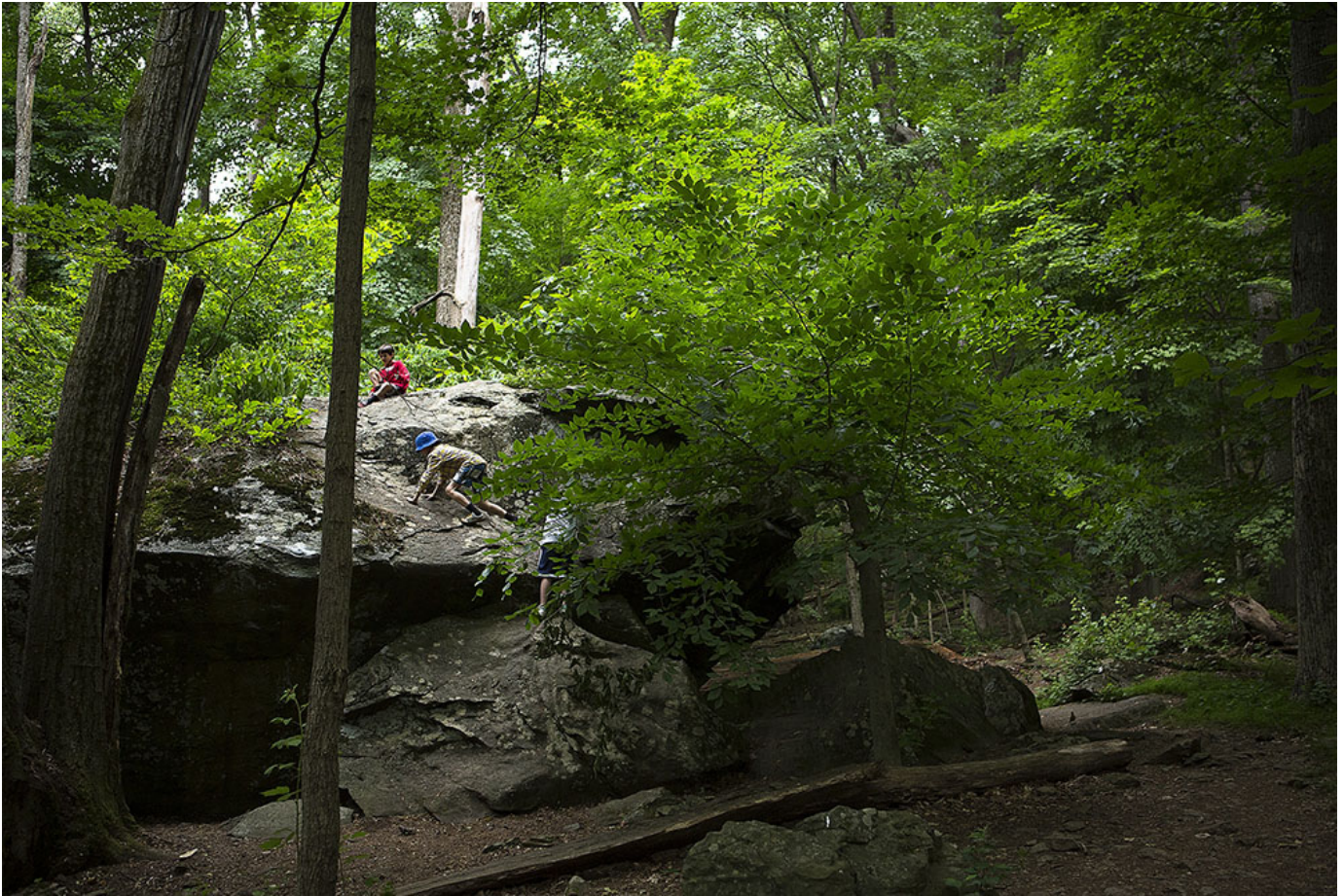
Children explore a trail at Cunningham Falls State Park June 17, 2020, in Thurmont, Maryland.

Estimates of how many species are lost each year vary widely, but scientists say that more species are becoming extinct because of human activities and climate change than would disappear naturally in the same amount of time.