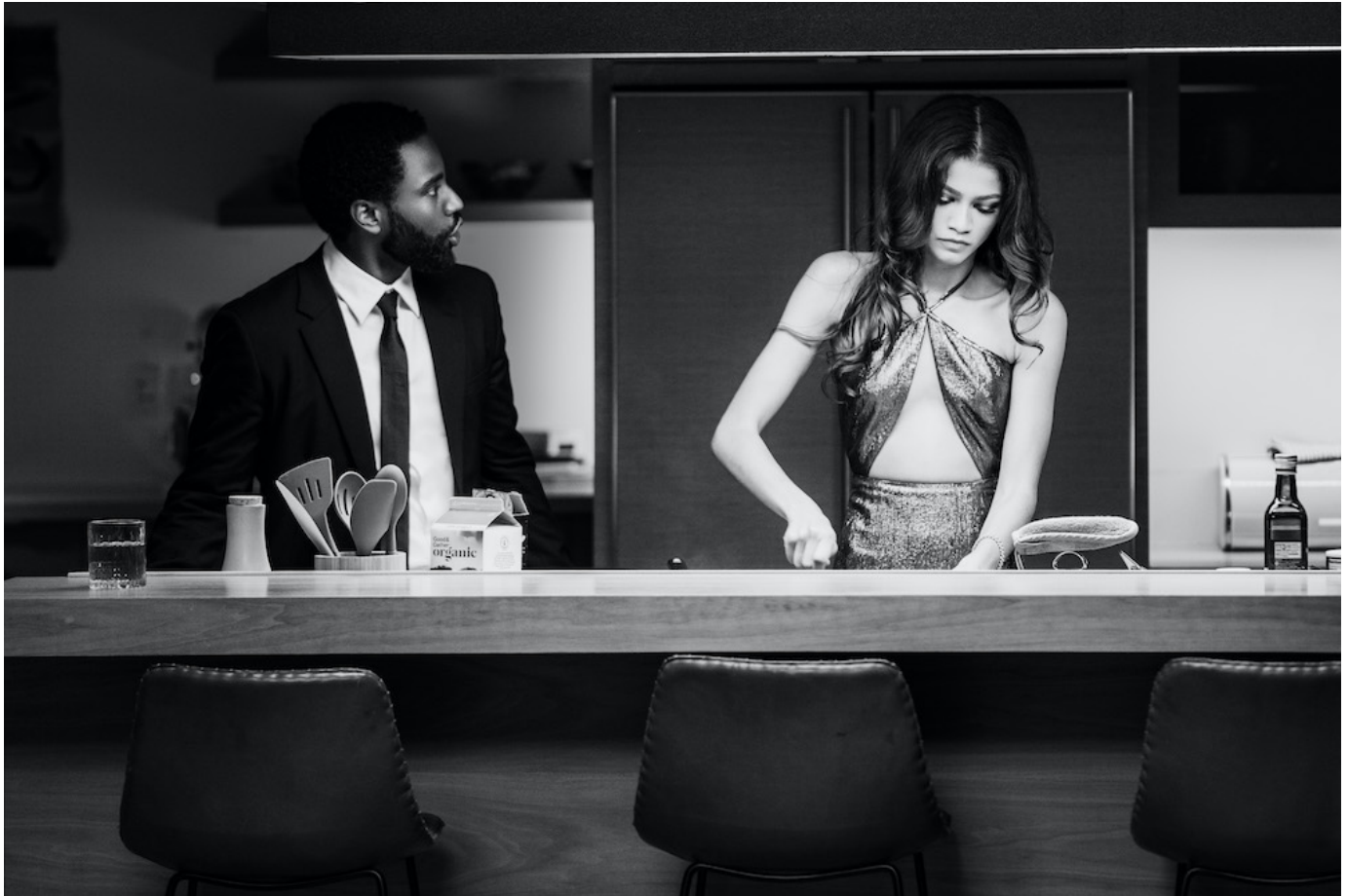
John David Washington as Malcolm, left, and Zendaya as Marie in a scene from "Malcolm & Marie"