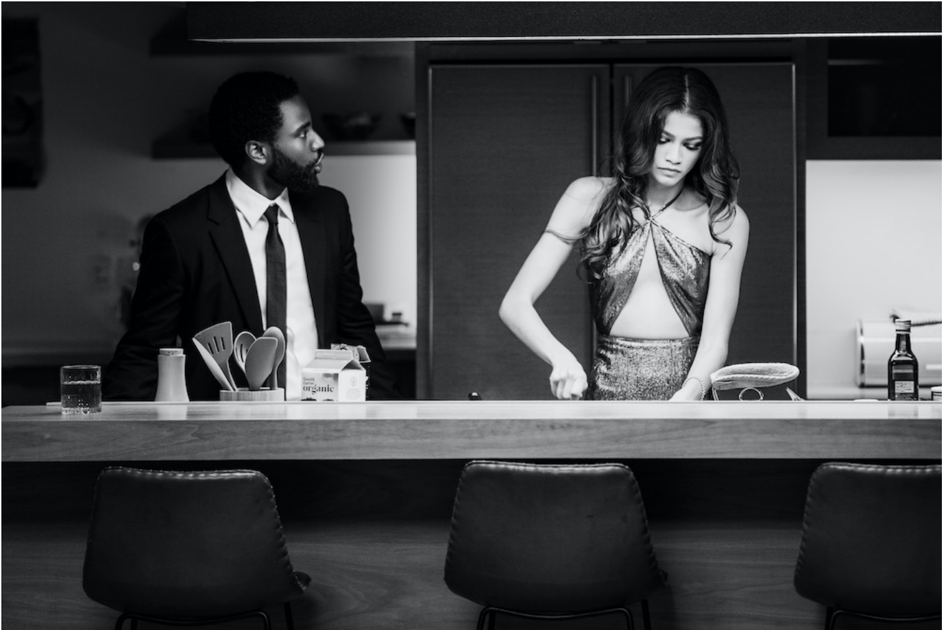
John David Washington as Malcolm, left, and Zendaya as Marie in a scene from "Malcolm & Marie"