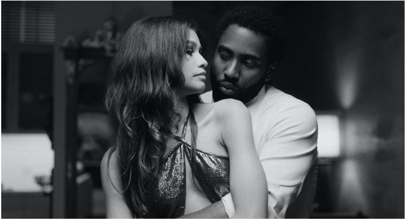
Zendaya as Marie, left, and John David Washington as Malcolm in a scene from "Malcolm & Marie"