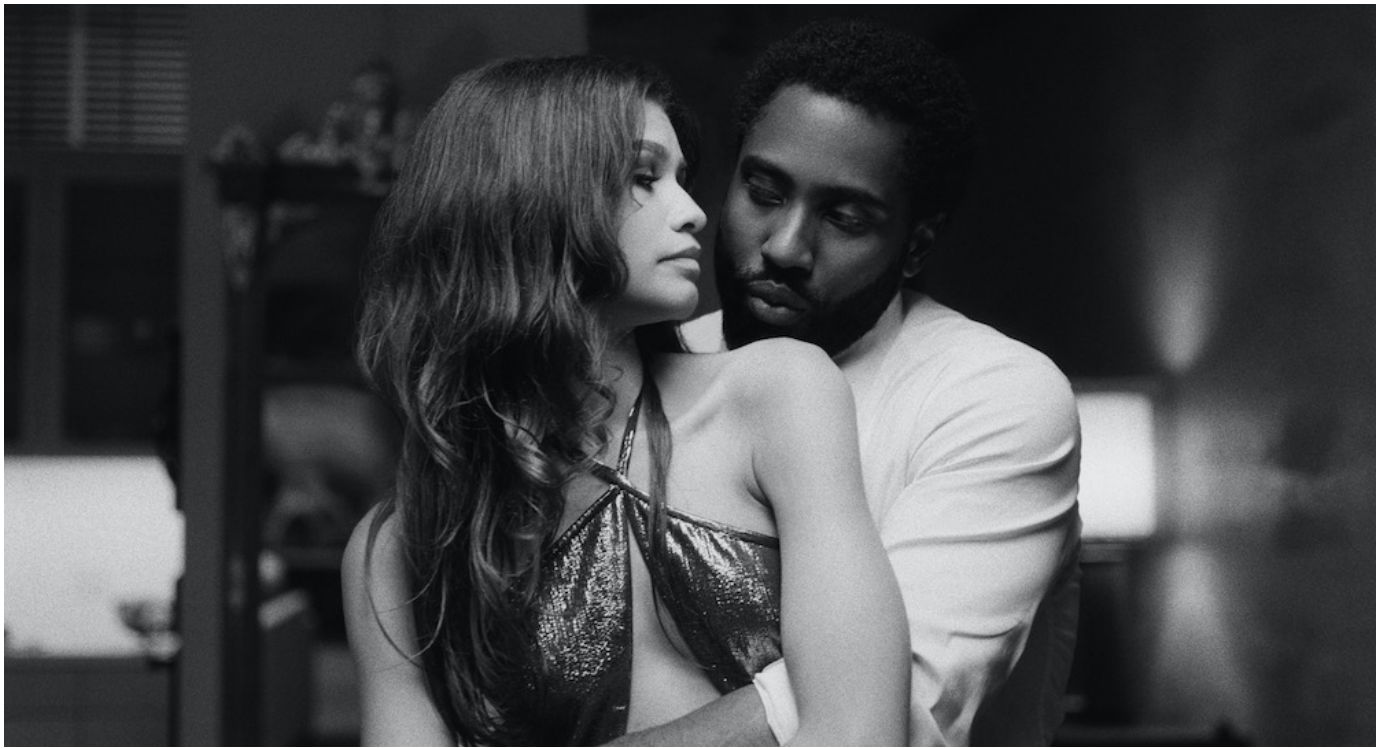
Zendaya as Marie, left, and John David Washington as Malcolm in a scene from "Malcolm & Marie"