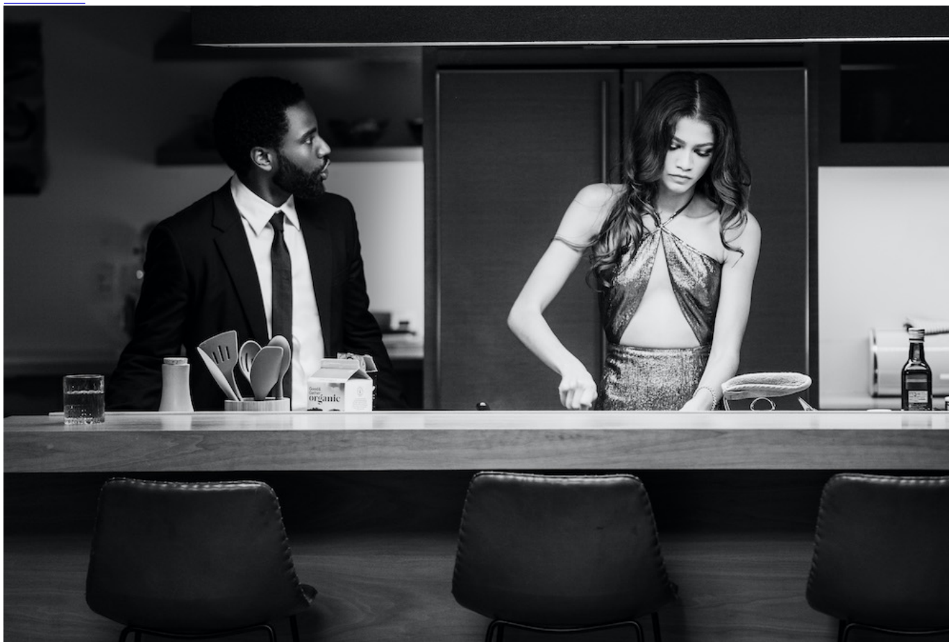
John David Washington as Malcolm, left, and Zendaya as Marie in a scene from "Malcolm & Marie"