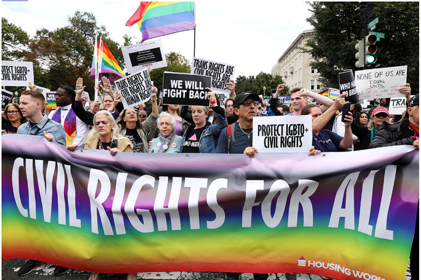
Activists demonstrate in support of LGBTQ rights outside the U.S. Supreme Court in Washington Oct. 8, 2019.