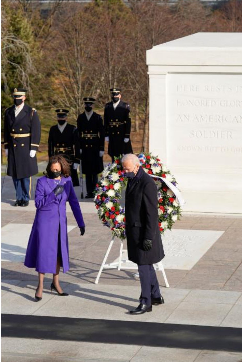
President Joe Biden and Vice President Kamala Harris participate in a wreath-laying ceremony at the Tomb of the Unknown Soldier at Arlington National Cemetery in Arlington, Va., Jan. 20, 2021.

let's start off fresh all of us. Let's begin to listen to one another again, hear one another, see one another, show respect to one another. Politics doesn't have to be a raging fire destroying everything in its path. Every disagreement doesn't have to be a cause for total war, and we must reject the culture in which facts themselves are manipulated and even manufactured.